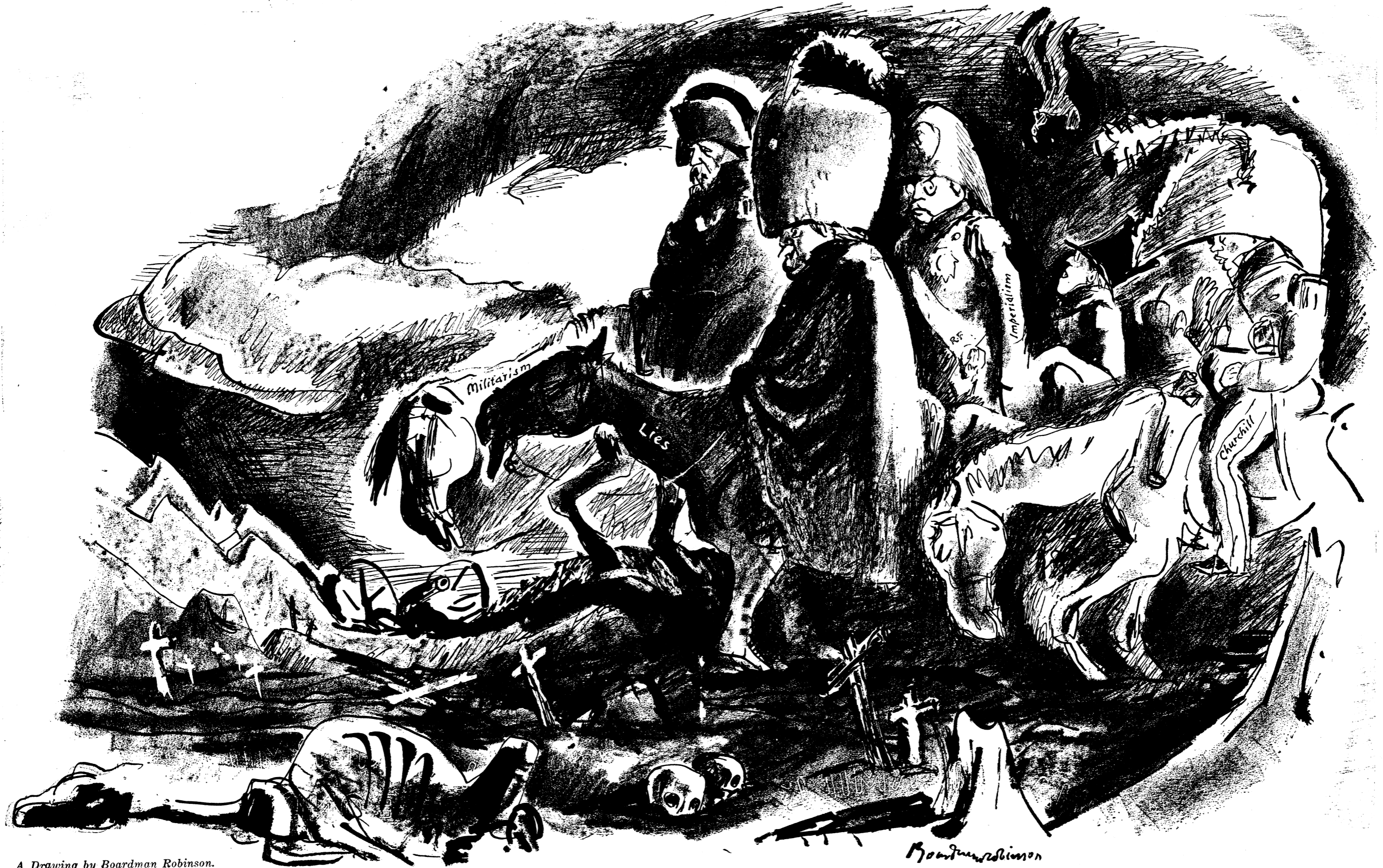
A Drawing by Boardman Robinson.