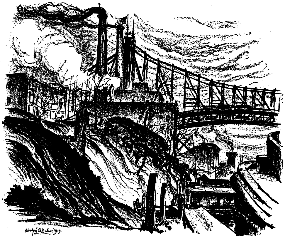
A Drawing by Adolph Dehn.

"I can see us sitting on the deck of the ship—each