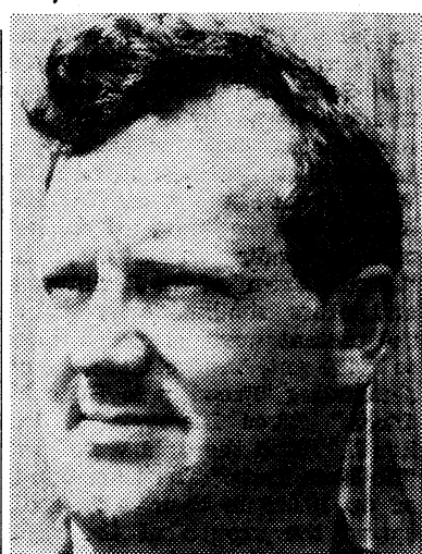
C. WRIGHT MILLS

American youth suffered a loss last month with the death of C. Wright Mills, one of the country's foremost sociologists. In books like the Power Elite , the Sociological Imagination , and the Causes of World War III , Mills boldly challenged prevalent academic orthodoxy, and had a powerful impact on students dissatisfied with official answers. He was an ardent supporter of the Cuban Revolution, and his book Listen Yankee was instrumental in bringing the truth about Cuba to thousands. In his newest book, The Marxists , he attempted to arouse interest among American students in the ideas of socialism. The editors of the Young Socialist join in paying tribute to this great thinker and humanitarian.