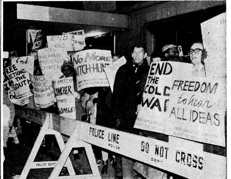
Anti-YAF picketers chant, "Unite Against the Right!"

An ad hoc committee, the Youth Organizing Committee Against the Ultra-Right Rally, issued a call for the anti-YAF demonstration as early as Feb. 8, when it called upon all organizations and individuals to participate in a non-exclusive manner on a united picket line. The line would be run in a democratic manner, with all organizations free to use their own name and slogans if they so desired. Near the end of February, a second call came out in the name of Americans for Democratic Action and Students for a Democratic Society, which demanded that all who wished to picket do so under the name of