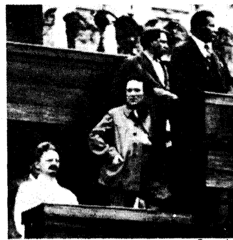
Trotsky (left) and Zinoviev (center) at 1926 funeral of Felix Dzerzhinsky.