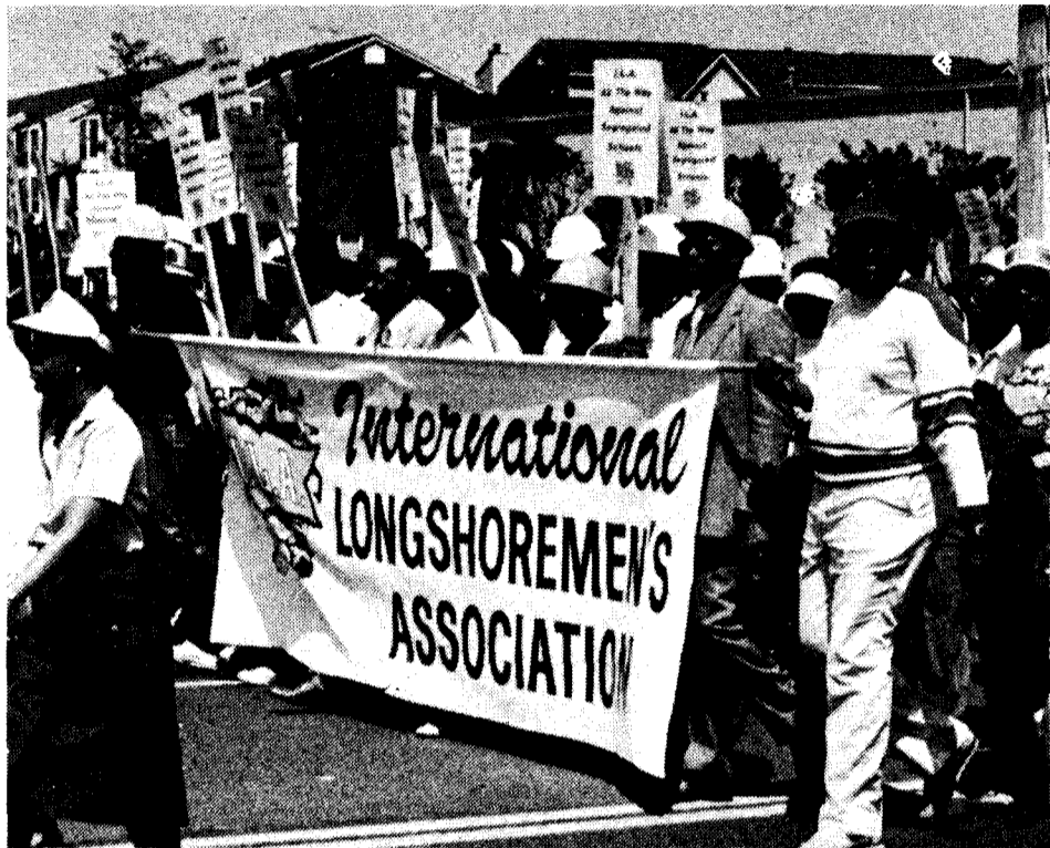
Norfolk: Union contingent marches for busing, May 1983. Signs say, "ILA All the Way Against Segregated Schools."

In the Tidewater area, we need the voice and support of every decent person around. The support of the trade unions is needed. If the Tidewater, Virginia Federal Employees Metal Trades' Council of the Norfolk Naval Shipyard (with its 17 affiliate locals), the longshoremen of Norfolk (the ILA) and the United Steelworkers of America of the Newport News Shipyard, decided to act against the decision of the Norfolk school board, this would force the board to do away with their pro-Klan tactics. And this would cause every decent person in the Tidewater to respect the trade unions. We do not need a halt to busing in the Tidewater area. What we need is to finish the Civil War, and the beginning of a workers party. ■