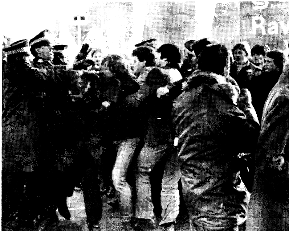
Miners battle cops outside Ravenscraig steel works in Scotland last May. Extend the strike to steel, power workers, dockers and railwaymen!

One of the main battlefields in the British coal strike has been financial. After judges declared the strike illegal and held the National Union of Mineworkers (NUM) in contempt of court, in a guerrilla war ranging from Dublin to Luxembourg and Zurich, Thatcher's government has tried to seize more than £9 million in NUM funds which the union sent abroad to escape this legal robbery. But meanwhile, the miners' struggle has awakened sympathy and solidarity around the globe. Soviet unions have contributed more than $1 million, including food and clothing, and the brutally oppressed South African miners have sent contributions