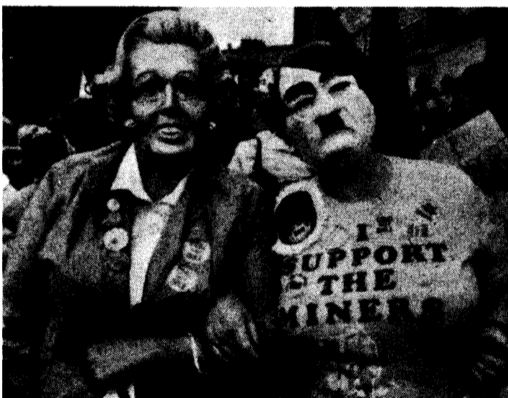
Miners' wives catch Iron Lady Thatcher arm in arm with other Führer Hitler.

but in terms of spirit, which is nearly tribal. Although there is hardship there is also an atmosphere of intense comradeship and altruism."