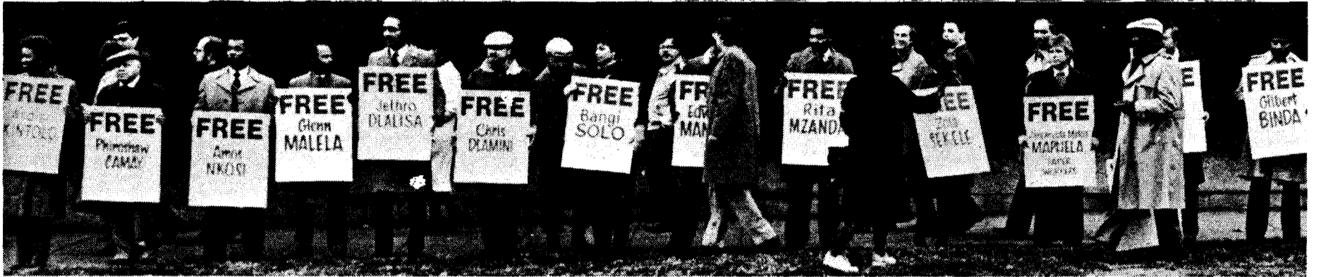
December 4: At South African embassy in Washington, AFL-CIO officials demand freedom for leaders of black trade unions.