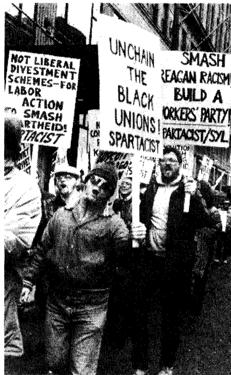
Cleveland, December 15: spirited Spartacist contingent protests outside South African consulate.

"It is perhaps difficult for White South Africans, with an ingrained prejudice against Communism, to understand why experienced African politicians so readily accept Communists as their