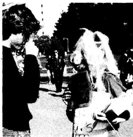
Red Avengers' Ms. Piggy at SF State.

- Know where you are, pig. Though you may, in your wettest of dreams,