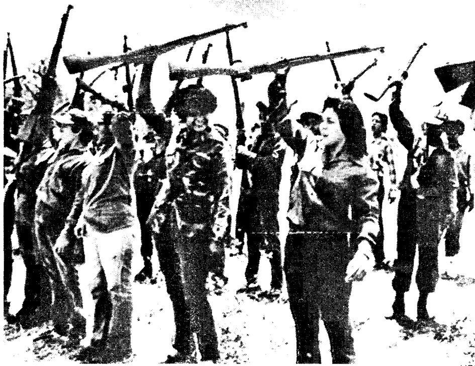
Popular militia can crush counterrevolutionaries, but Sandinista nationalists tolerate capitalist fifth column.

schema of "nonalignment, mixed economy and political pluralism." This was the programmatic expression of the FSLN's strategy of alliance with the "floating sectors of the middle bourgeoisie" which brought them to power. But today the choice of social revolution or bloody counterrevolution in Central America is unavoidable. The Sandinistas' own experience is making this clearer day by day: yesterday's "anti-Somozaist bourgeoisie" has become today's "sellout bourgeoisie." As nationalists, the FSLN keeps fighting against that choice, and because they place themselves at cross-purposes to the march of history, they can prepare the way to defeat for the masses. At best,