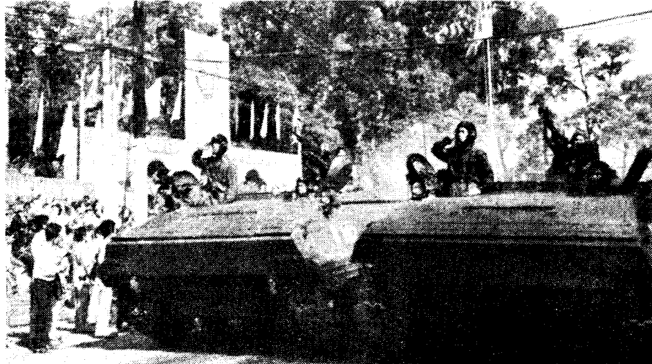
Victorious Vietnamese parade after the fall of Saigon, Spring 1975. U.S. Imperialism longs to crush Vietnamese Revolution after humiliating defeat.

Today, on the eighth anniversary of the fall of Saigon (30 April 1975), we salute the courageous workers and peasants of Vietnam. Unlike the mainstream "peace movement" of pro-imperialist politicians, liberals and reformists—which dried up when the