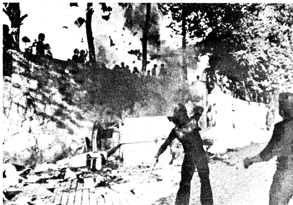
Portugal 1975: CIA-aided social democrats and Catholic hierarchy led mobs in attacks on Communist Party offices.

Beware of Socialists bearing D-marks and dollars, and of unionists in papal robes. ■