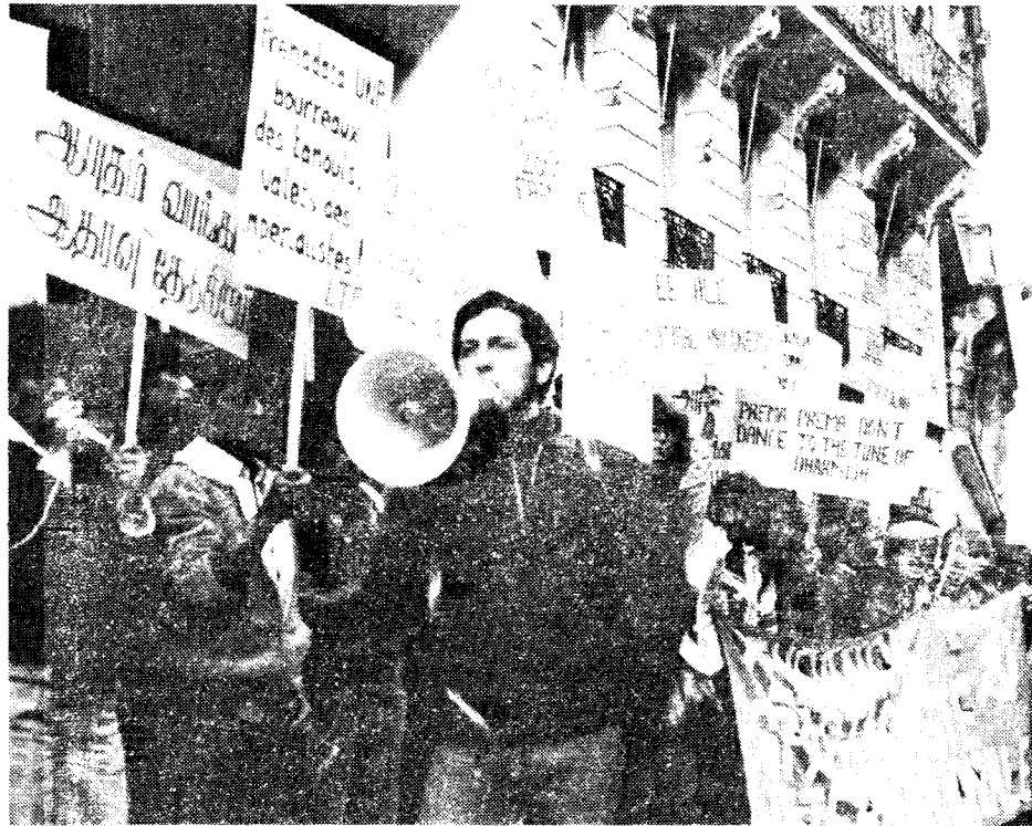
Paris, April 21: French Trotskyists, Tamil activists protest Sri Lankan hangman Premadasa.

"The U.S. base at Diego Garcia and their attempt to gain access to the militarily key Trincomalee harbor are crucial to the counterrevolutionary designs of the imperialists to reconquer the workers states like the Soviet Union and Vietnam. Not one inch of Lanka to the imperialists! Stop imperialist arms deals with the J.R. government! France and U.S. out of the Indian Ocean!"