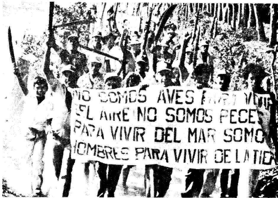
Association of Rural Workers: "We aren't birds that live in the air, nor fish that live in the sea. We are men who live off the land." But Sandinista leadership has protected the landlords and kulaks who live off the peasants.