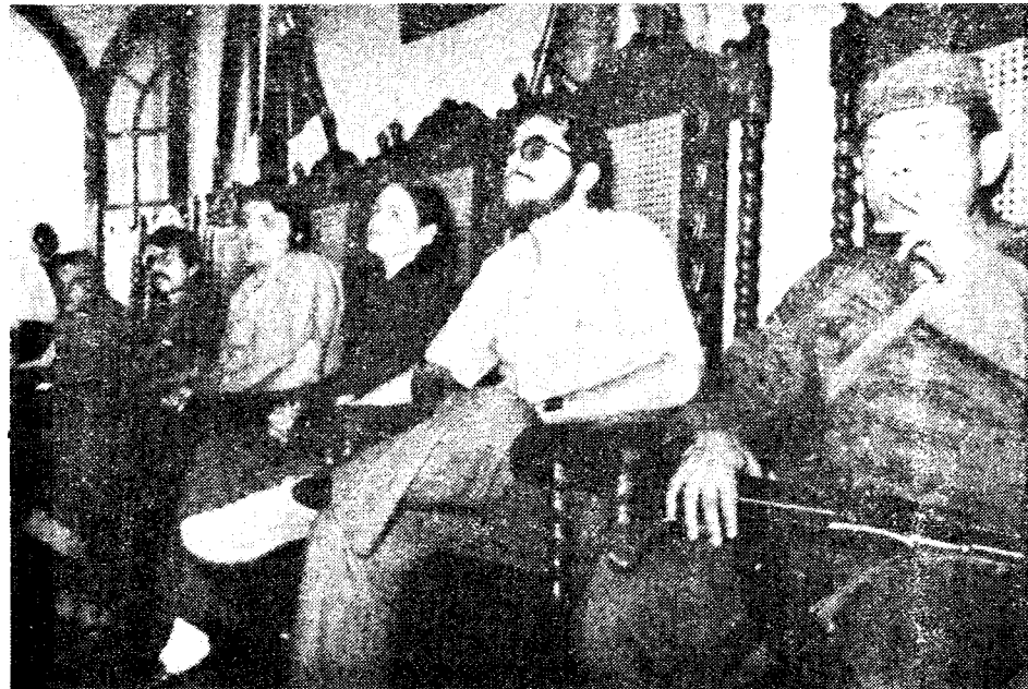
Sandinista/bourgeois junta, July 1979: (from right) Borge, Robelo, Chamorro, Ramirez, Ortega. Now Robelo and Chamorro are with the contras .

For close to four years, the Sandinistas have governed Nicaragua along their