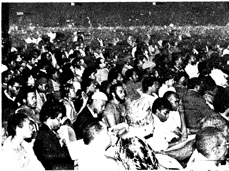
"National Black Party" meeting in Philadelphia. Blacks need class-struggle politics not squabbling to pressure the Democrats.

Seeking to cash in on this post-election mood among blacks, a disparate group of black politicians has attempted to rush into the obvious vacuum of black leadership. At a conference in Philadelphia on November 21-23, attended by some 1,300