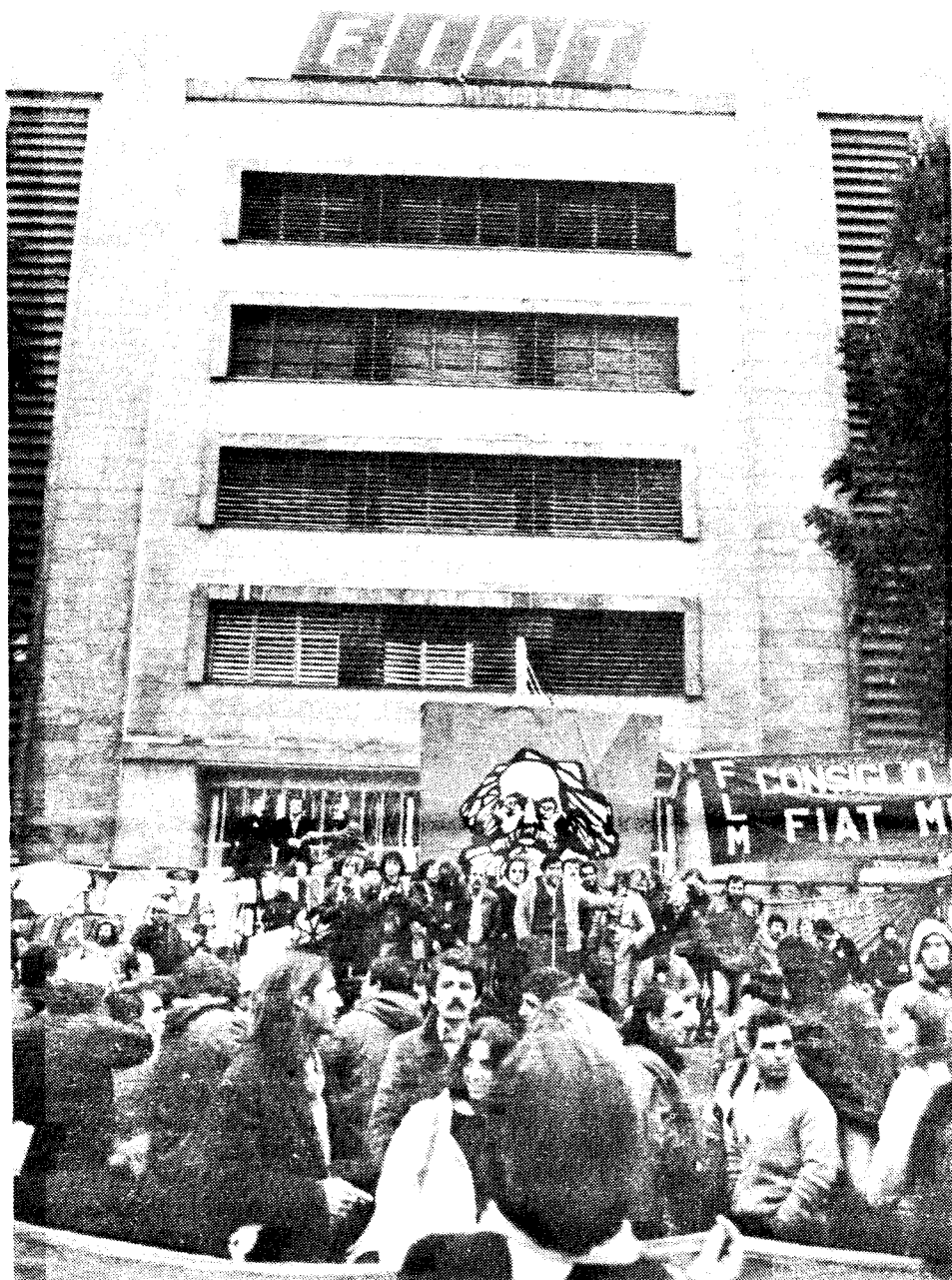
Strike rally at FIAT headquarters, September 25.