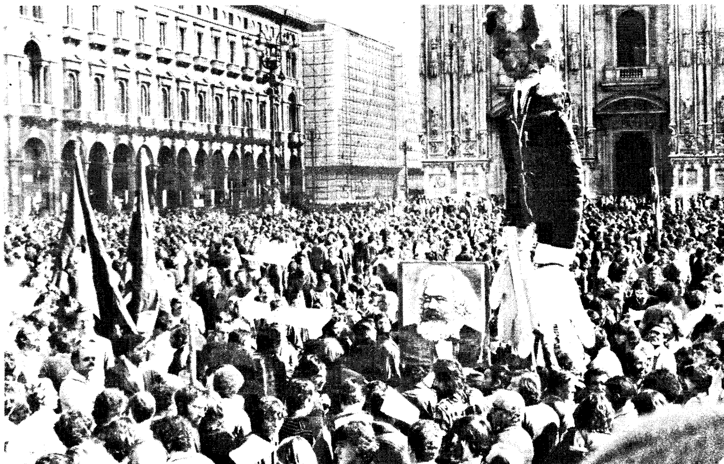
Milano, October 10: Workers demonstrate in support of Fiat strike.