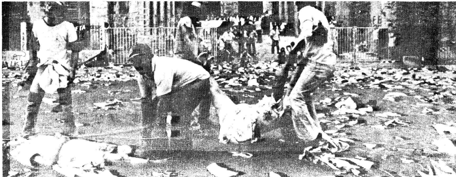
Mourners of assassinated Archbishop Romero massacred at the Cathedral, San Salvador, Spring 1980.