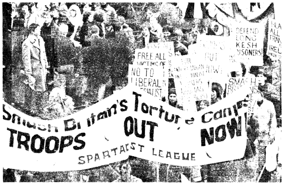
Spartacist contingent protests Northern Ireland torture-jails, London, November 15.

In Ulster today the oppressed Catholic population exists in dire poverty, discriminated against by the dominant Protestant majority and the British state. Socialists defend Republi-