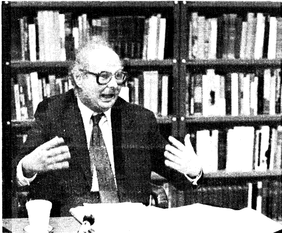
Israel Shahak: Israeli civil libertarian, defender of Palestinian rights.

Shahak also describes the exploitation of Jewish religious obscurantism in the service of Zionist chauvinism. But he is not a vicarious nationalist who believes that the plight of the oppressed is alleviated by disguising their oppression, including their ideological oppression. Thus he discusses as well the role of Islam as a sectarian and reactionary force among Palestinian Arabs both in Israel and the West Bank.