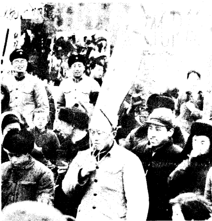
1967: Maoist Red Guards humiliate party cadre.

necessary to establish guilt. But confession (extracted in pre-Communist China by the liberal use of torture) played such an important part in traditional Chinese jurisprudence that a defendant's refusal to admit his/her alleged crimes raises doubts in the minds of the population as to their guilt. Thus Chiang and Chang's recalcitrance is clearly a black eye for Deng and his colleagues.