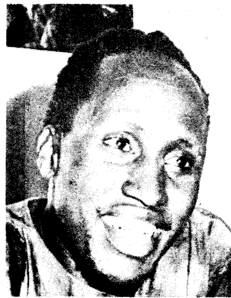
Ngugi wa Thiong'o

Kenyatta's successors may attempt to gain credibility by undoing the worst