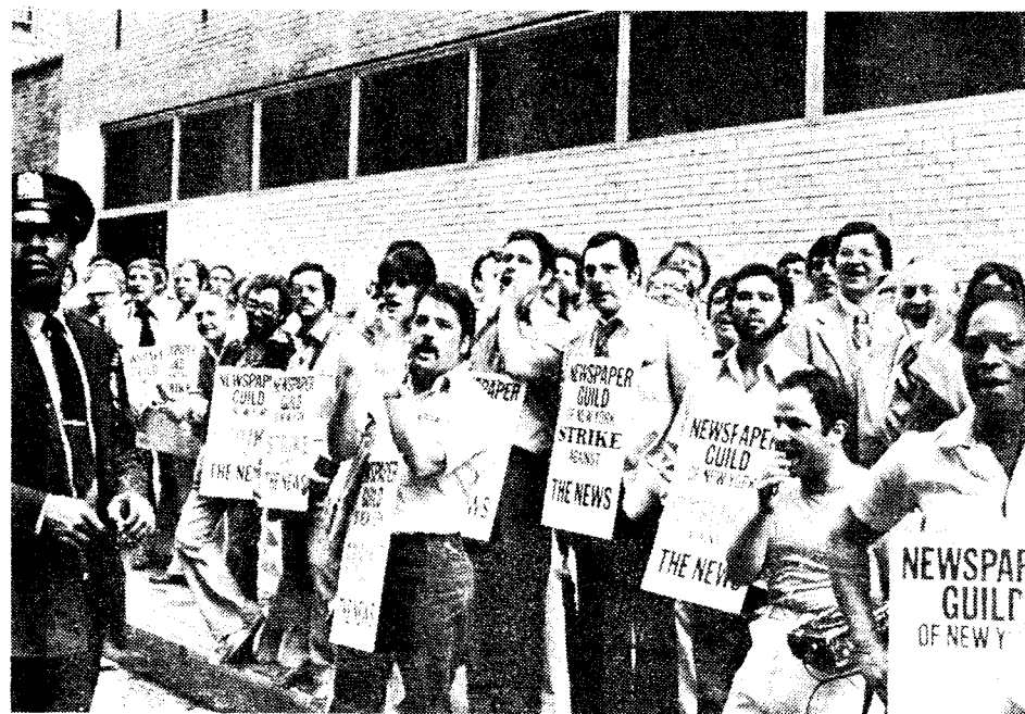
Newspaper Guild pickets outside the Daily News building in June.

Of course the printing trades bureaucracy will argue that there is no alternative—that if they shut down the parasitic press the Guild will go back to work, the deliverers will scab and the pressmen will be alone. Is there really no alternative to allowing these papers to come out until management can induce one or another union to go back just like at the Washington Post ? Is there really no alternative to sitting back and waiting