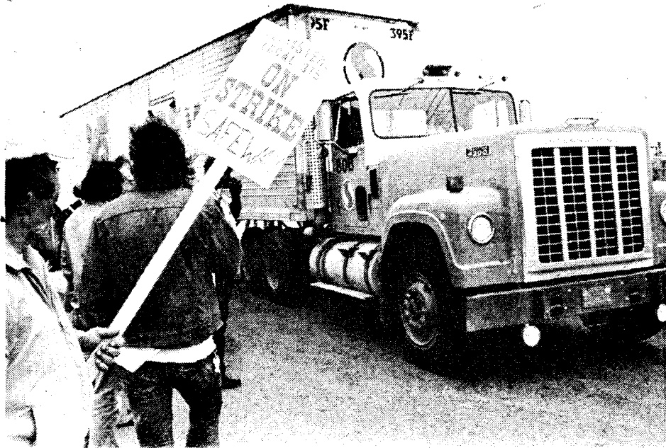
Teamsters picket Safeway chain in Richmond, California.

The FEC deliberately escalated the confrontation on August 9 by initiating a lockout against the 3,500 Teamsters affected by the contract bargaining—a union-busting tactic not seen in major negotiations here for many years. In July the only Teamster unit on strike had been maverick Local 315, whose 1,100 members struck the Safeway distribution center in Richmond a week after its contract expired on July 11. With Safeway reportedly receiving large subsidies (up to $1 million per week) from the employers' association, it launched a massive scabberding operation. Since Local 315's independent contract has a reputation as a pacesetter in the area's food distribution industry, the strike quickly turned into a test case for the industrywide negotiations between the FEC and the Western Conference of Teamsters. The bosses made a