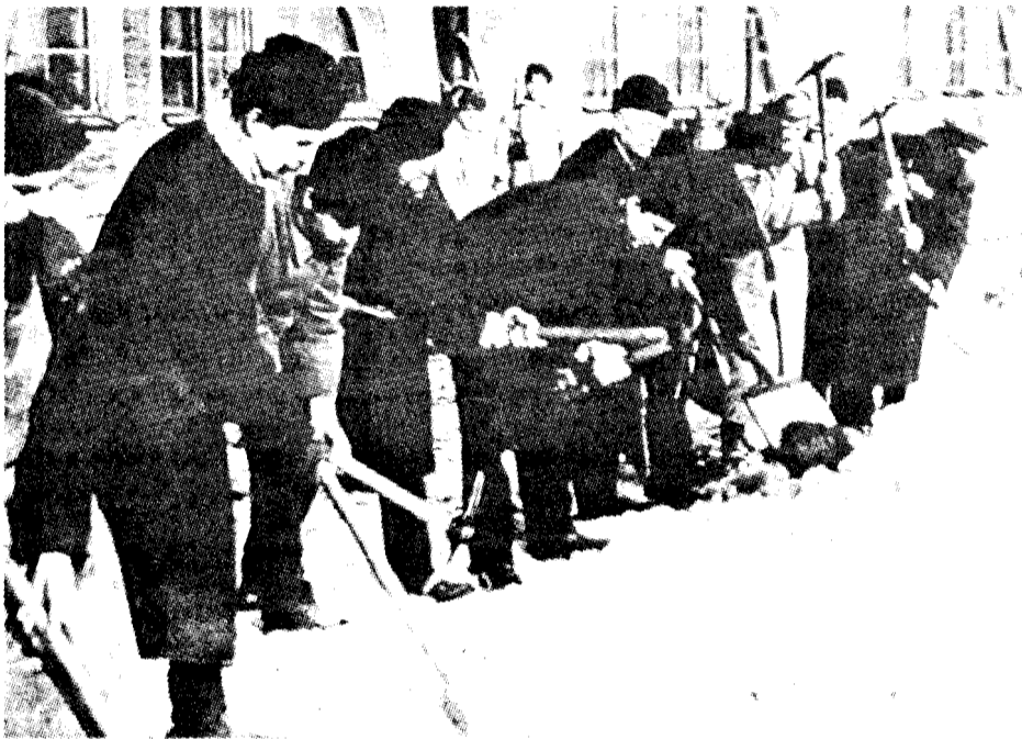
Former members of the Russian bourgeoisie at compulsory labor, 1918.

I strongly agree with you that "Socialists do not proceed from the standpoint of punishing the offender." I would add that socialists can no longer believe that putting anybody in prison is going to do him or her any good. If Marx still thought in 1875 that productive labor engaged in by prisoners was "corrective," he was wrong. A century later anybody can see that "houses of correction," so-called, are not what they were cracked up to be. I hope you will not tell me that corrective labor won't work under capitalism but will after the revolution. The revolutionary party