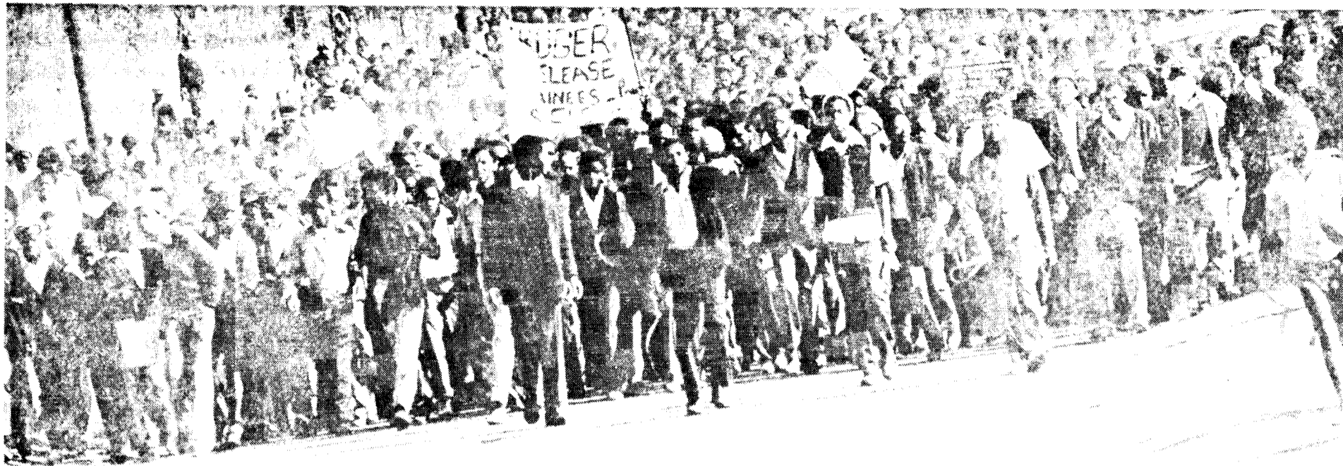
Anti-apartheid youth march to demand that minister of justice Kruger release militants.