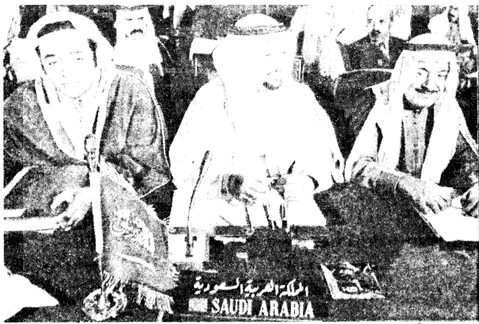
Saudi oil minister Sheik Yamani (center) at recent OPEC conference in Qatar.