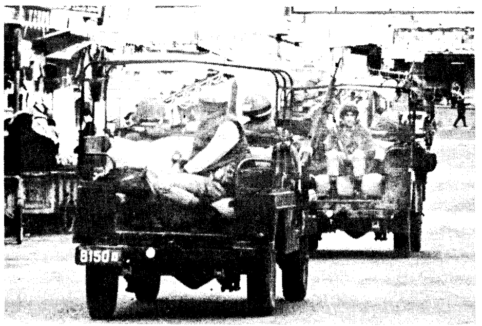
Israeli troops patrol Nablus in the West Bank after recent Arab demonstrations.