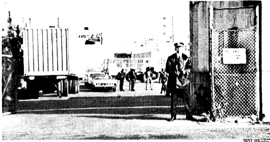
Cops and company guards at struck Associated Freight depot in San Francisco.