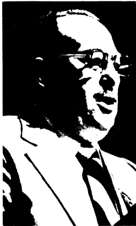
CP Joe Morris, Canadian Labour Congress president.

"Labour has always set the price at which it would support 'the system.'... The price of labour's future support