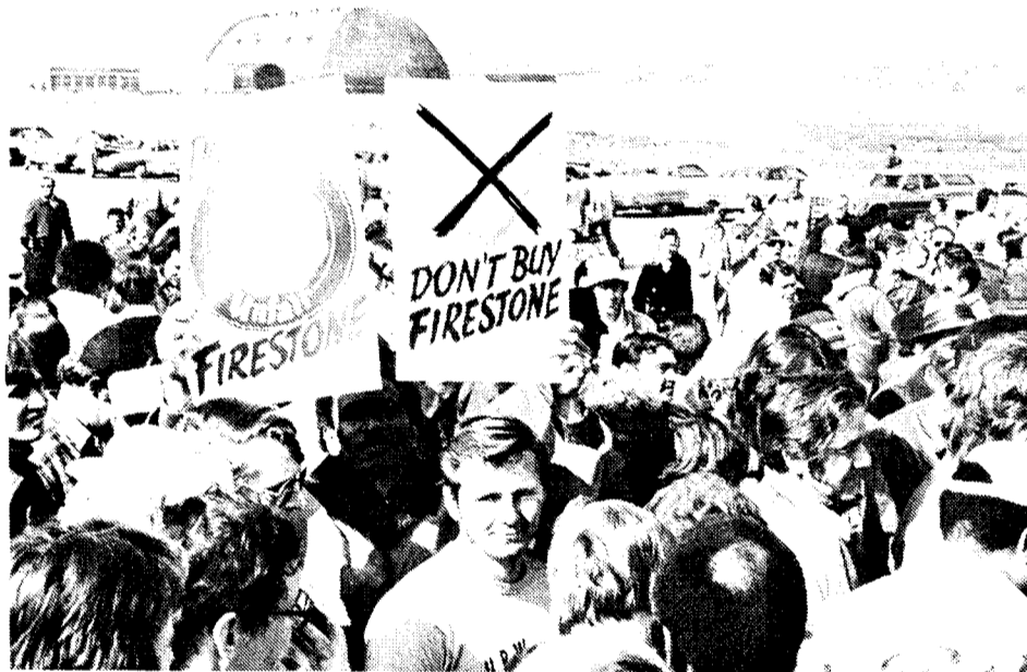
URW “strategy” in rubber strike is impotent consumer boycott. Militant unionists must demand an industrywide strike, including Canada, and solidarity strike action by the UAW.