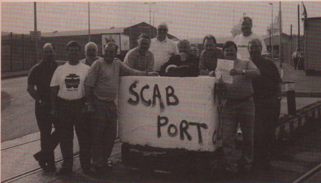
Liverpool dockers' Strand Road picket. For latest news, see page 3

A NEW political organisation of Marxists who will fight together to move towards a new party of the working class will be formed this October.