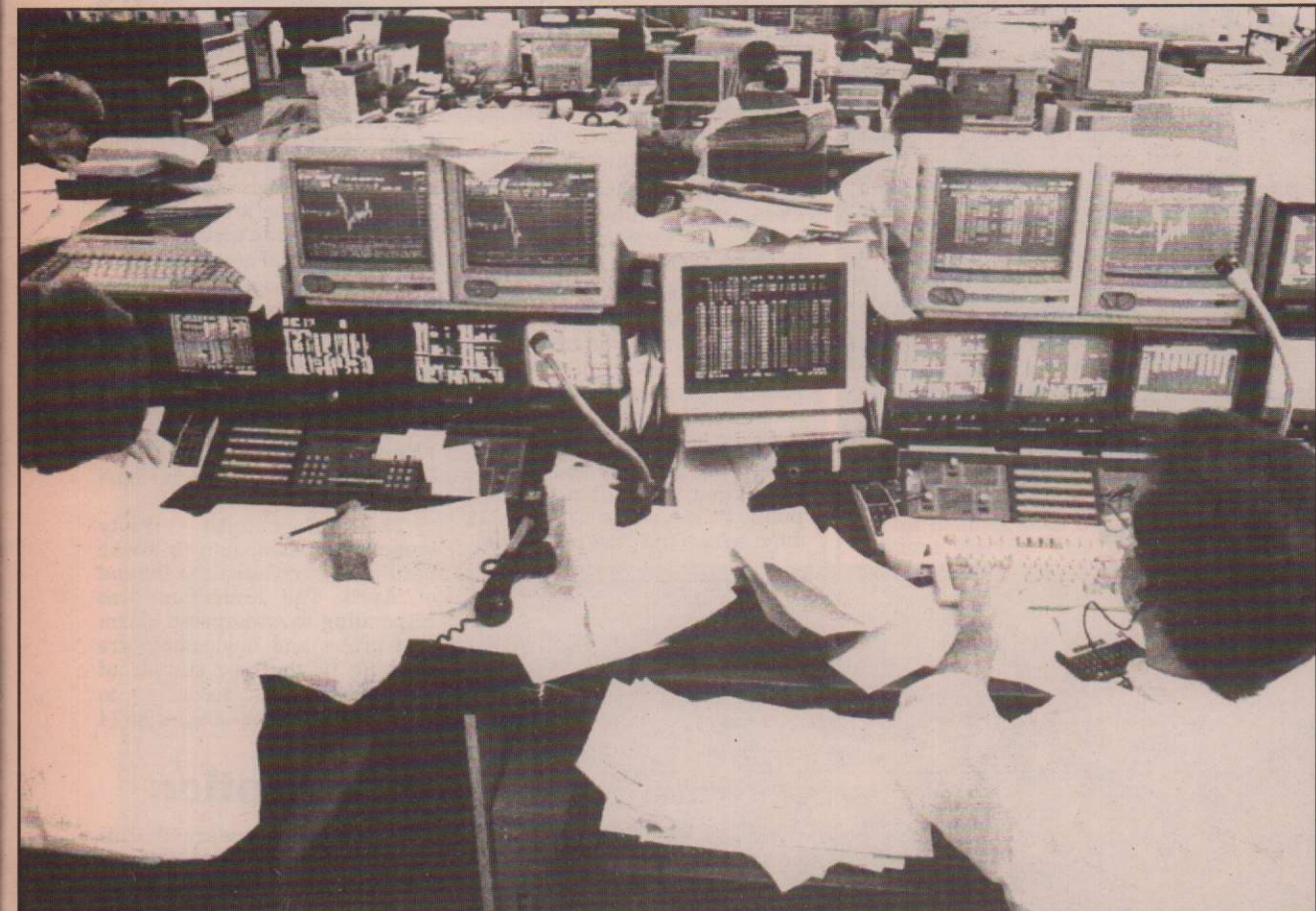
New York: Global trading takes place increasingly by computer

Suggested topics cover areas such as the human genetics/IQ debate, animal rights and capitalist farming methods, human health, destruction of the environment, and the crisis in science. Please do not hesitate to forward your views on topics that you feel we should include.