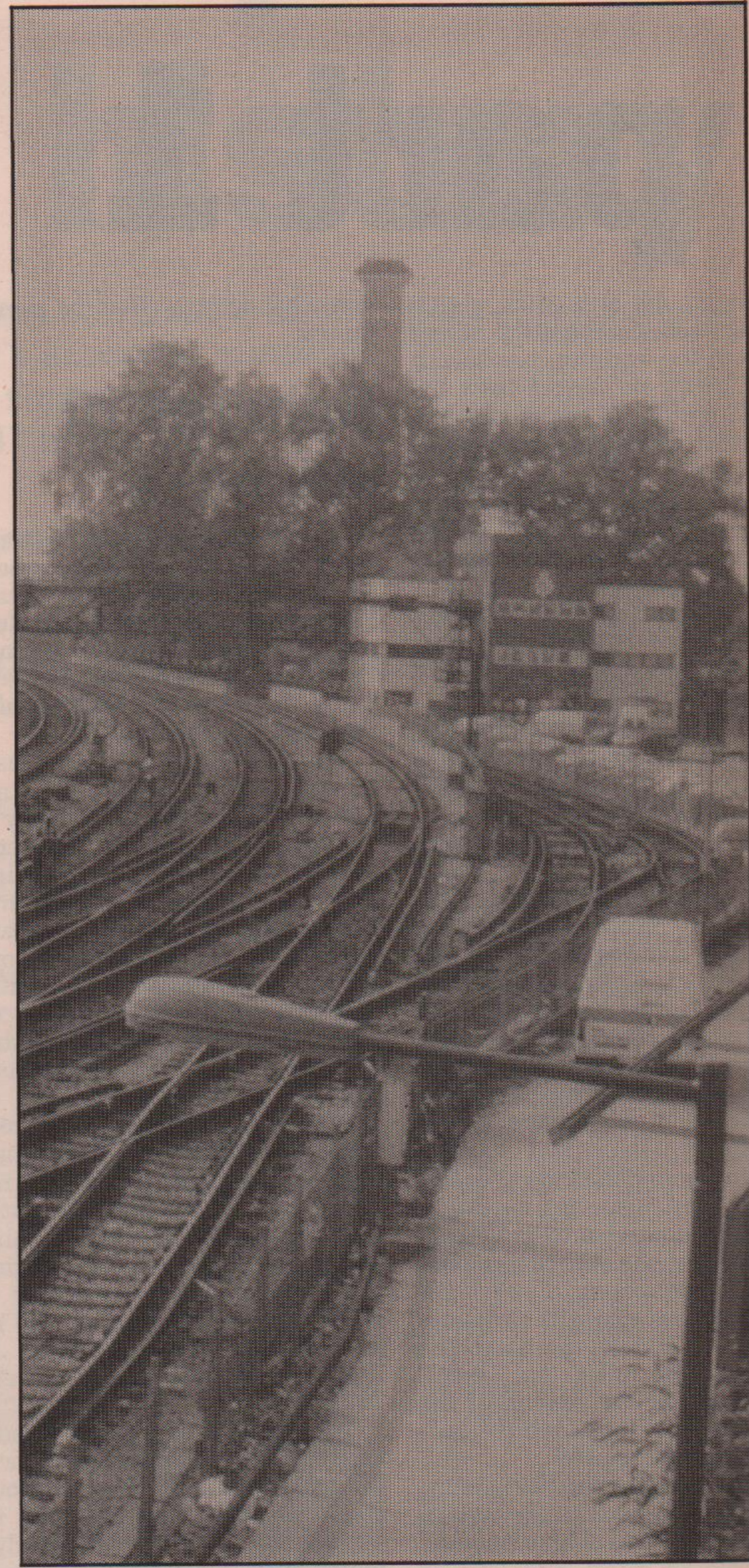
Please be patient — stations are nothing to do with the trains!

Still, a privatised industry will probably close more rail services altogether. As for that old idea of a fully-integrated planned transport system, come on comrade, you'll be talking about Clause Four next! Don't you want to be modernised — for the 'customers', by van or by train!