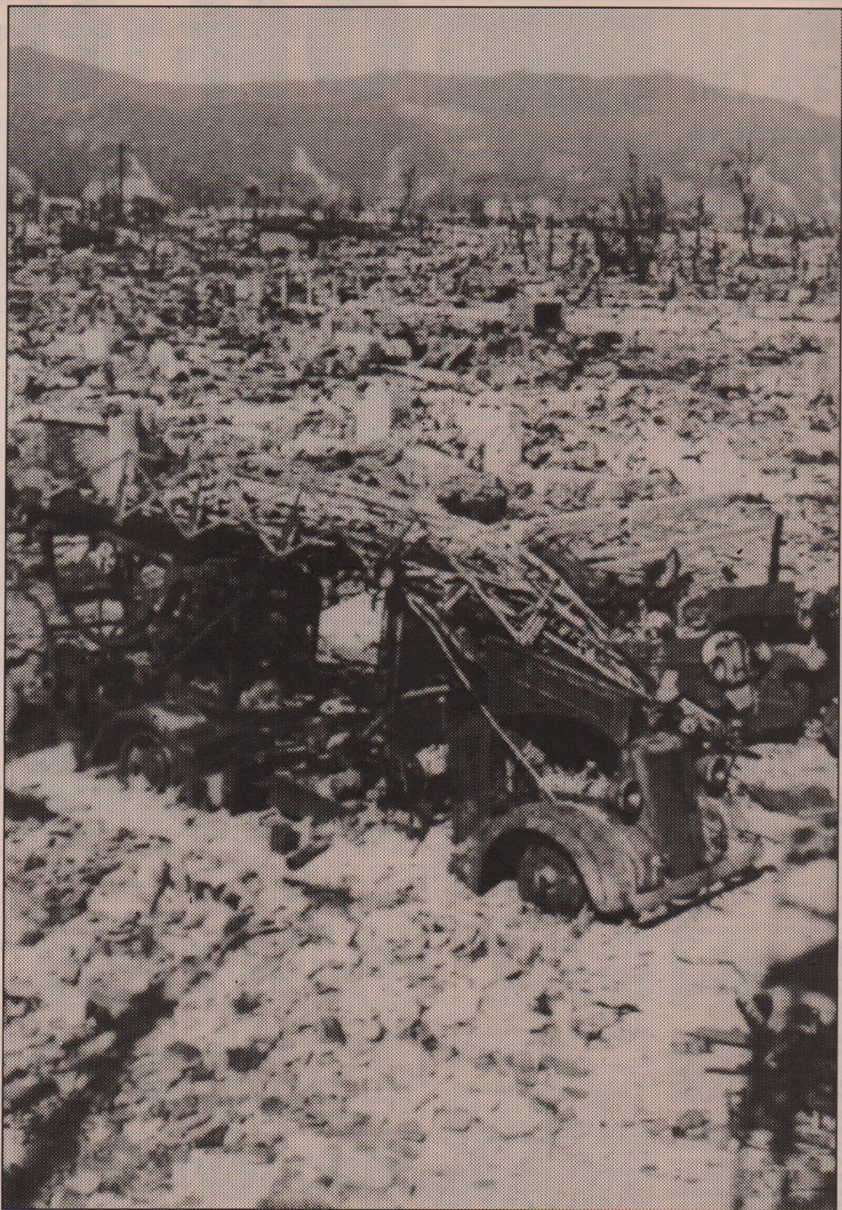
Hiroshima after the bomb, 1945: during Allied bombing 40 per cent of Japan's city buildings were destroyed

SO MUCH for the conventional wisdom. Why was Japanese capitalism