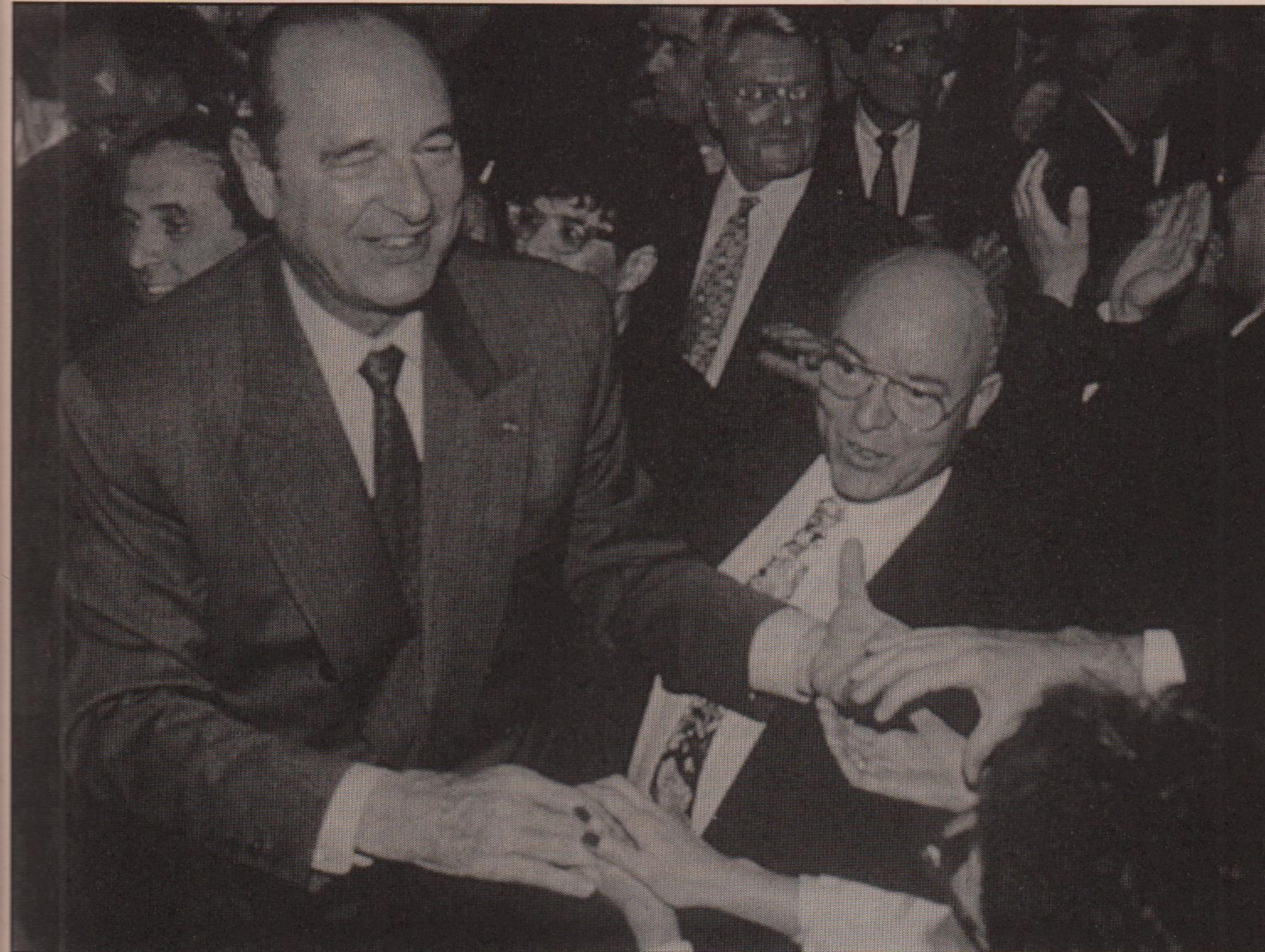
Chirac promises more privatisation, tax breaks for businesses, cuts in benefits, more VAT: no change from Socialist presidency