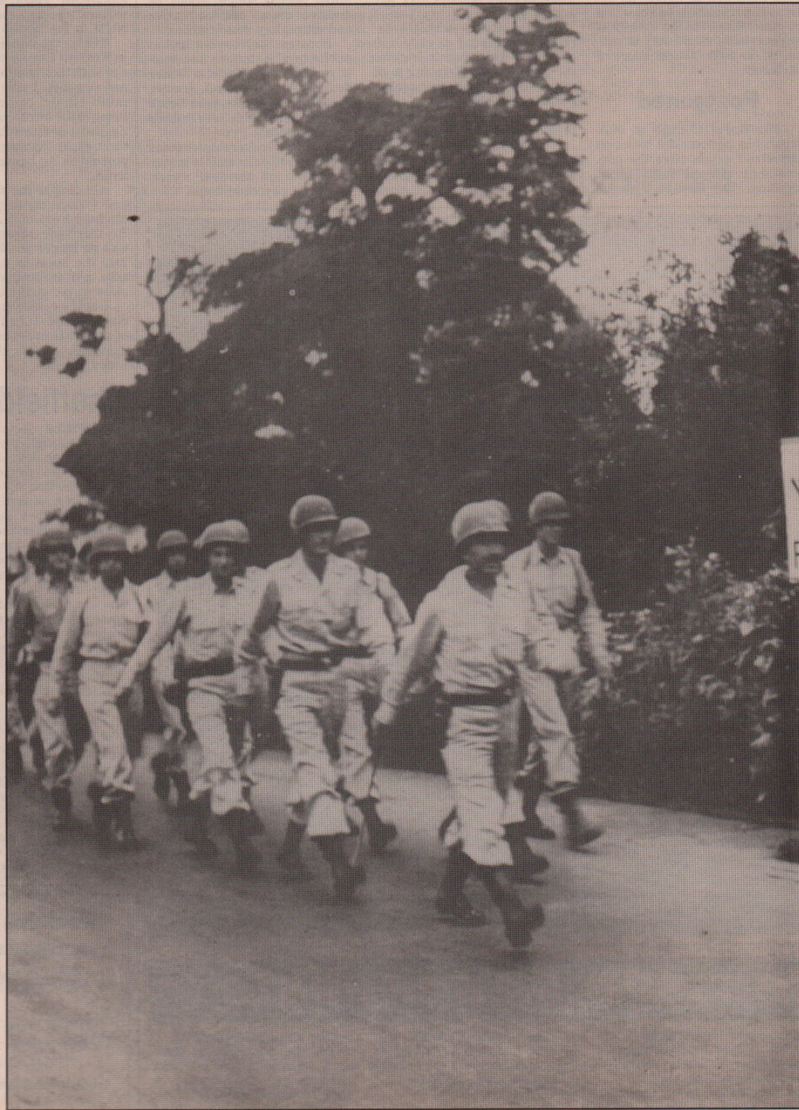
After the Japanese surrender in 1945, US occupation troops under General MacArthur entered the country

This week, Slaughter motivates the need for this study in the light of the fall of Stalinism and describes the struggle of the Japanese workers up to the collapse of the government in April 1946. Next week, he will go into the role of the Communist Party in defusing the revolutionary situation and how its conceptions and aims were almost identical with those of the US occupiers.