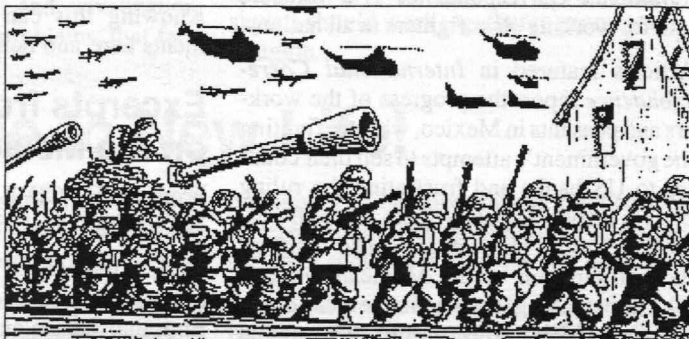
U.S. troops bring peace to Bosnia.

forces are complaining about the presence of Muslim or Islamic volunteers shows that they want to disarm and disable Bosnia even more. The young men and women who are now in the U.S. armed forces should be devoting themselves to fighting the corporate criminals in the U.S. and building things that people need, not going to foreign countries that they don't know anything about and pushing the people around. U.S. troops out of Bosnia now! Lift the embargo so the Bosnians can defend themselves!