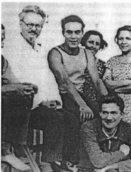
Trotsky and young friends.

But while he wrestled victoriously with nature, man built up his relations to other men blindly, almost like the bee or the ant. Slowly and very haltingly he approached the problems of human society. The Reformation represented the first victory of bourgeois individualism and rationalism in a domain which had been ruled by dead tradition. From the Church critical thought went on to the State. Born in the struggle with absolutism and the Medieval estates, the doctrine of the sovereignty of the people and of the rights of man and the citizen grew stronger. Thus arose the system of parlia-