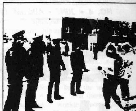
Decatur police work overtime to harass and intimidate Staley workers exercising their right to free speech.