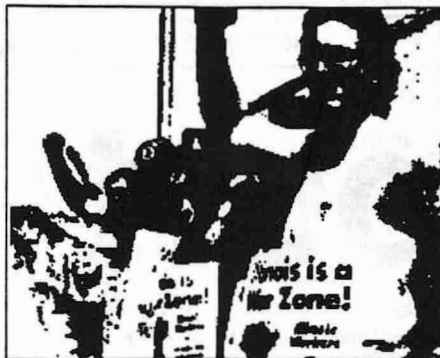
Staley and Caterpillar workers form a 2 mile human chain between the two factories last year.

Familiar with the kinds of union-busting tactics that were being used against them,