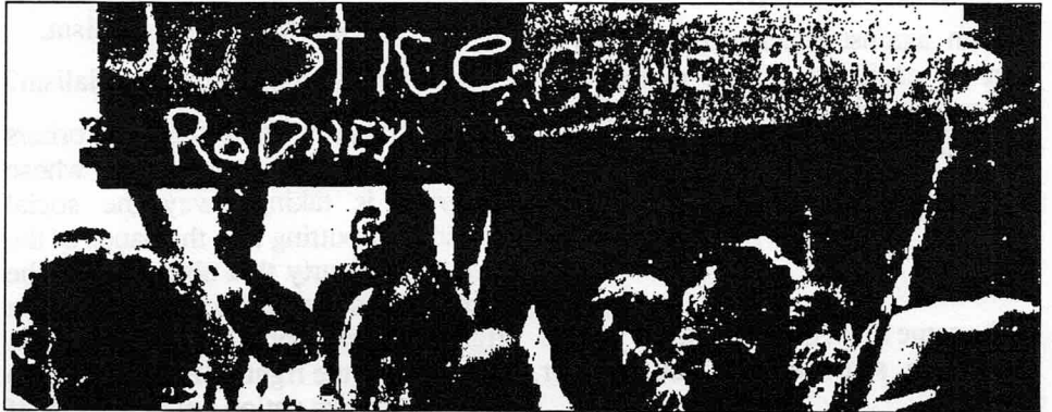
People marched in Highland Park, May 3, demanding justice for Rodney King.

George Bush, a Republican, and Mayor Bradley, a Black Democrat, both condemned the young people of Los Angeles and right now are continuing the