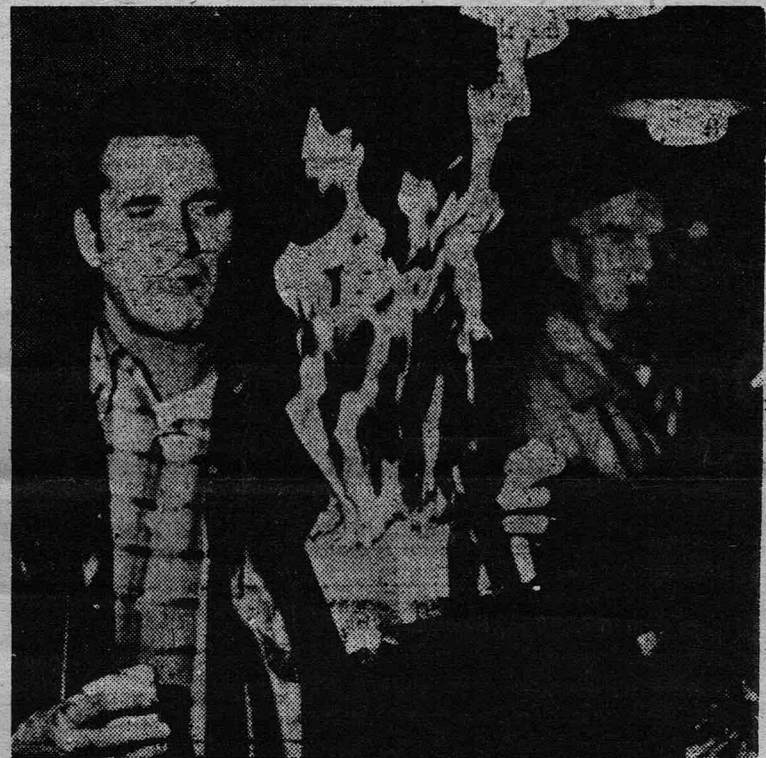
Miner burns sell-out contract during 1978 strike.

Because of the publication of the documents of the Sixth National Conference, the article on the slanders against the Fourth International will appear in a forthcoming issue.