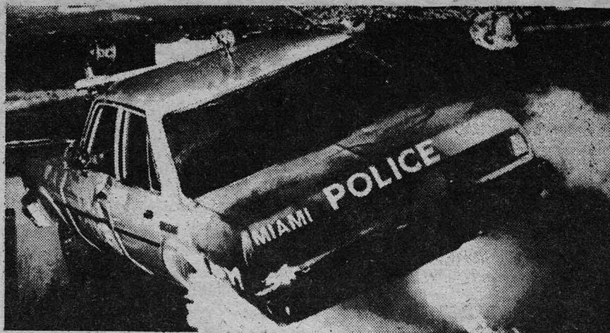
Police car in flames during 1980 Miami rebellion.

The youth organizations, the YWLL, the YSA and others, are held in the grip of