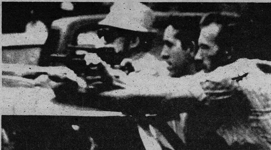
Armed miners confront scabs. But above all the miners need a political weapon, the Workers Party.

The Sixth National Conference of the Trotskyist Organization/USA launches an open combat to regroup the revolutionary forces. It puts forward the party and its working class character — the struggle for the Workers Party — against those who would dissolve the workers initiatives into the diverse petty bourgeois movements. It puts forward its international and revolutionary character against centrism and the pro-Castroist SWP. It puts forward the common struggle for the defense and extension of the Polish Revolution and the turn of the class struggle on an international scale, as the way out for the militants and tendencies of the workers movement