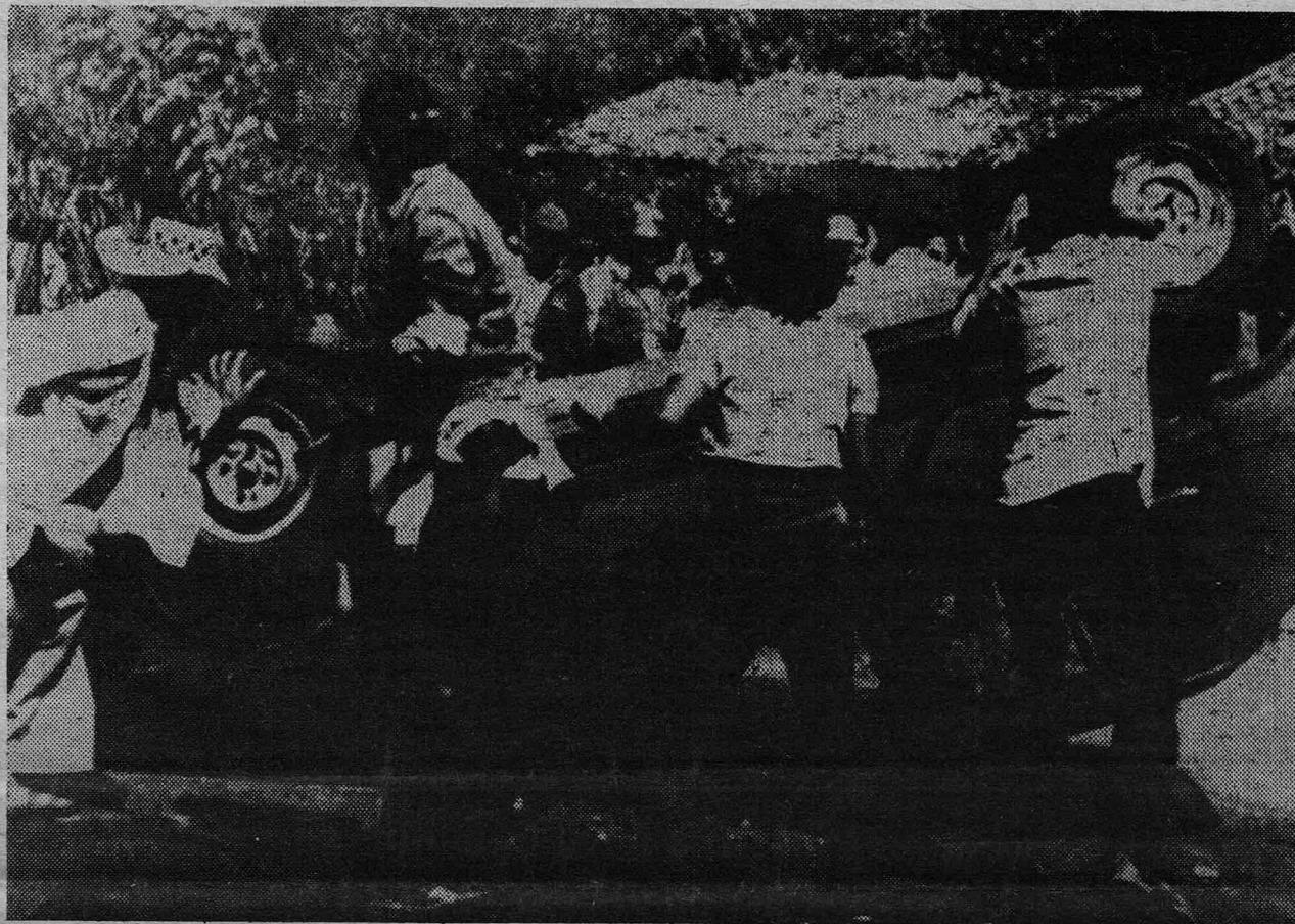
Youth in El Salvador building a roadblock against the junta's troops. The revolution in Central America represents the beginning of the revolution here.

On the basis of these decisions, the Conference concluded by electing a new leadership to carry out the policy decided on. TRUTH