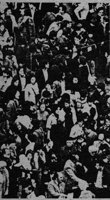
Demonstration in Spain for release of political prisoners -- 1975

monstration against the Tenerife assassinations.