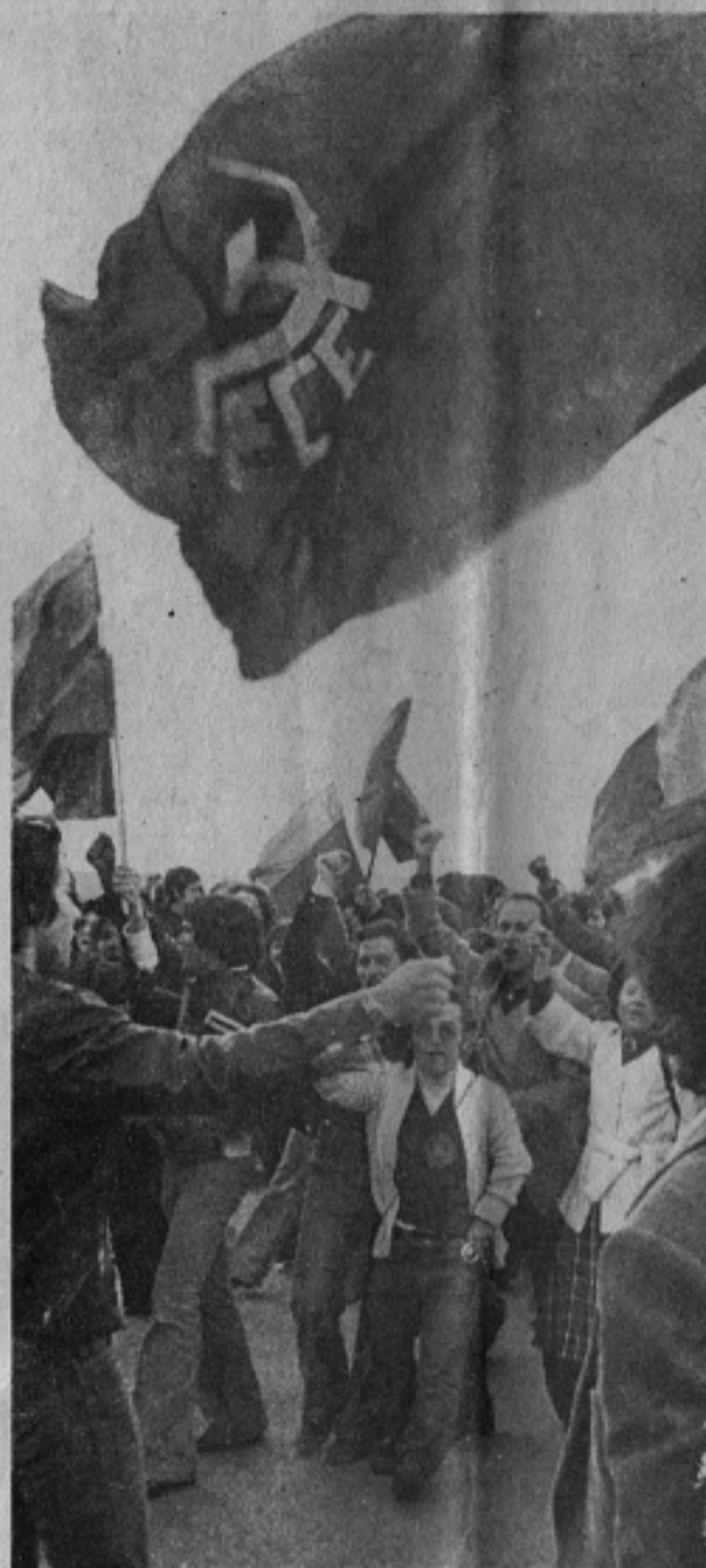
Spanish "Communist" Party pretends to defend workers, in reality supports monarchy.