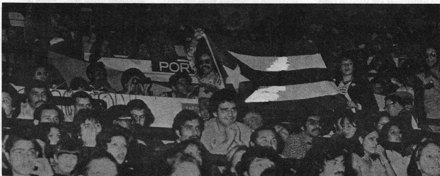
RALLY FOR PUERTO RICAN INDEPENDENCE IN NEW YORK CITY

Stop All Aid To The Military Regime In Argentina!