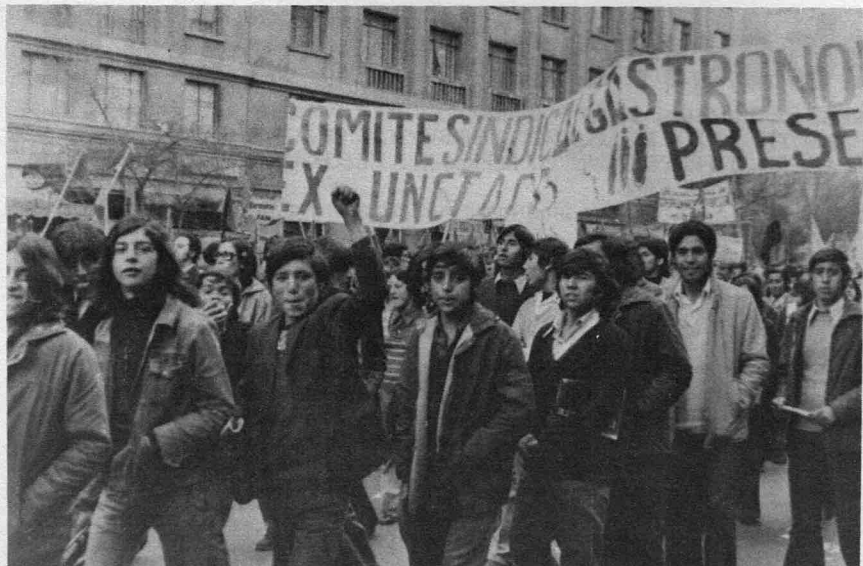
DEMONSTRATION IN CHILE