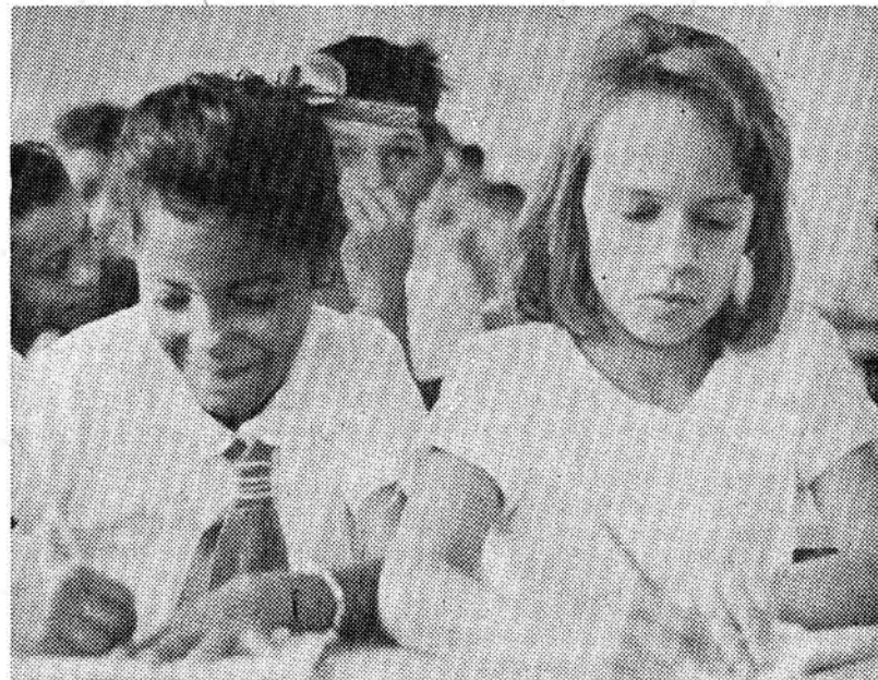
GROWING UP RATIONAL. All Cuban children now have opportunity for free education in a society that has stamped out racial discrimination.

When I say that Cuba is building a new society, please don't