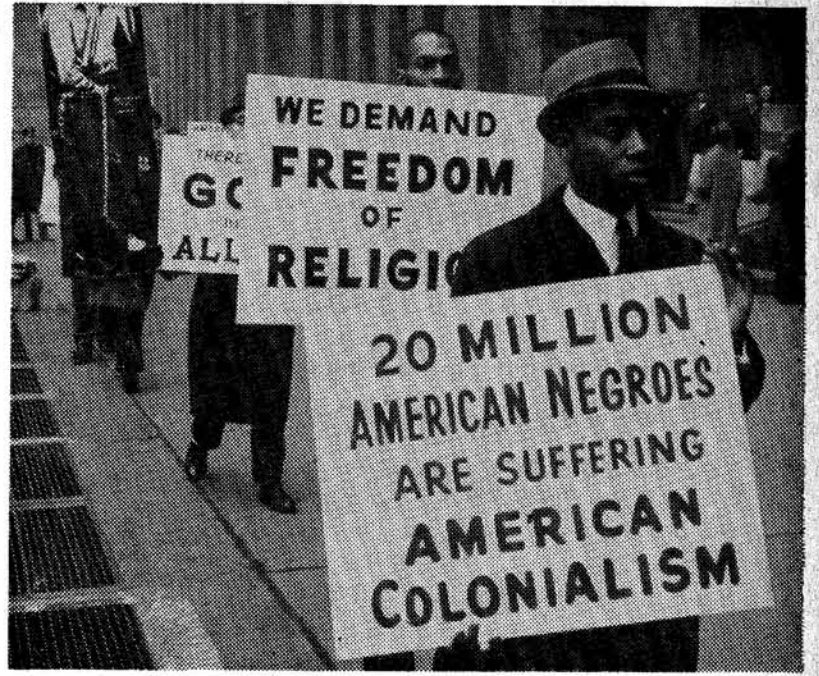
PROTEST POLICE HARASSMENT. Muslims in New York picket police court to protest arbitrary arrest of members selling press.

Most socialists, including the Socialist Workers Party, believe that fighting for reforms is not in contradiction with, but a part of, the