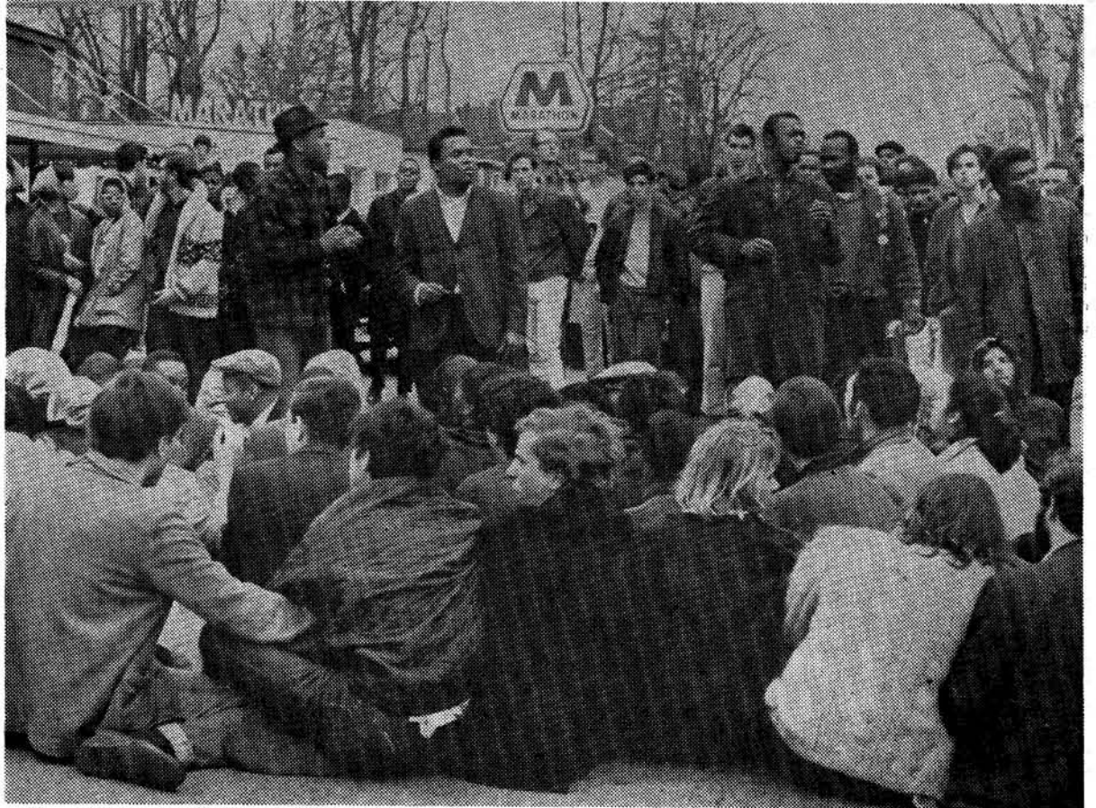
PRELUDE TO POLICE ATTACK. This was scene in Yellow Springs, Ohio, March 14 just before cops attacked civil-rights sitdowners with tear gas, hoses and clubs. The demonstrators — students from Antioch College, Central State College, and Wilberforce University — were protesting continued flouting by local barber of Ohio law barring refusal of service to Negroes. Standing in foreground at right and leading demonstrators in song are SNCC's Freedom Singers.