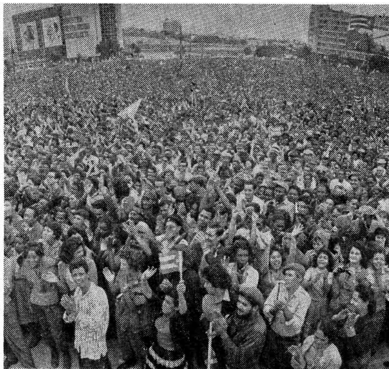
THE NEW WORLD has never before seen such crowds as those which rally to Cuba's revolutionary government. Shown above is the Jan. 2, 1962 celebration of the revolution's third anniversary.

ministration in the United States, when President Kennedy assumed the presidency, we again reiterated our willingness to solve by peaceful means the situation of tension that existed. The replies to these words and the answer to those offers of peace were very clear. They were embodied in the continuation of the aggressive policy of the previous administration, the aggression against and the invasion of our country and the carrying out by the present government, as President Kennedy acknowledged of the plans of aggression and invasion of Cuba that had been drawn up by the previous administration.