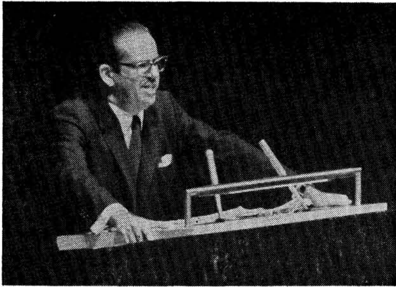
APPEALING TO WORLD OPINION. Cuban President Osvaldo Dorticos at the United Nations presenting his indictment of U.S. aggression against his country.

On more than one occasion in the past Cuba has clearly made known its position on each of these questions which are to be discussed at this session of the assembly. Our Prime Minister made Cuba's position clear on these matters at the 15th regular session. Today, as then, we stress once again our concern in all the activities, conduct or agreements that may or can assist in the achievement of general and complete disarmament, not only because this will ultimately lead to the liquidation of the material possibilities of war, but also be-