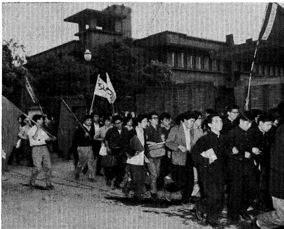
Japanese students demonstrate in front of the official residence of Japanese Prime Minister Nobusuke Kishi in Tokyo against the new military pact between Japan and the U.S. Because of steamroller tactics in pushing the pact through parliament, the students demanded that Kishi resign.