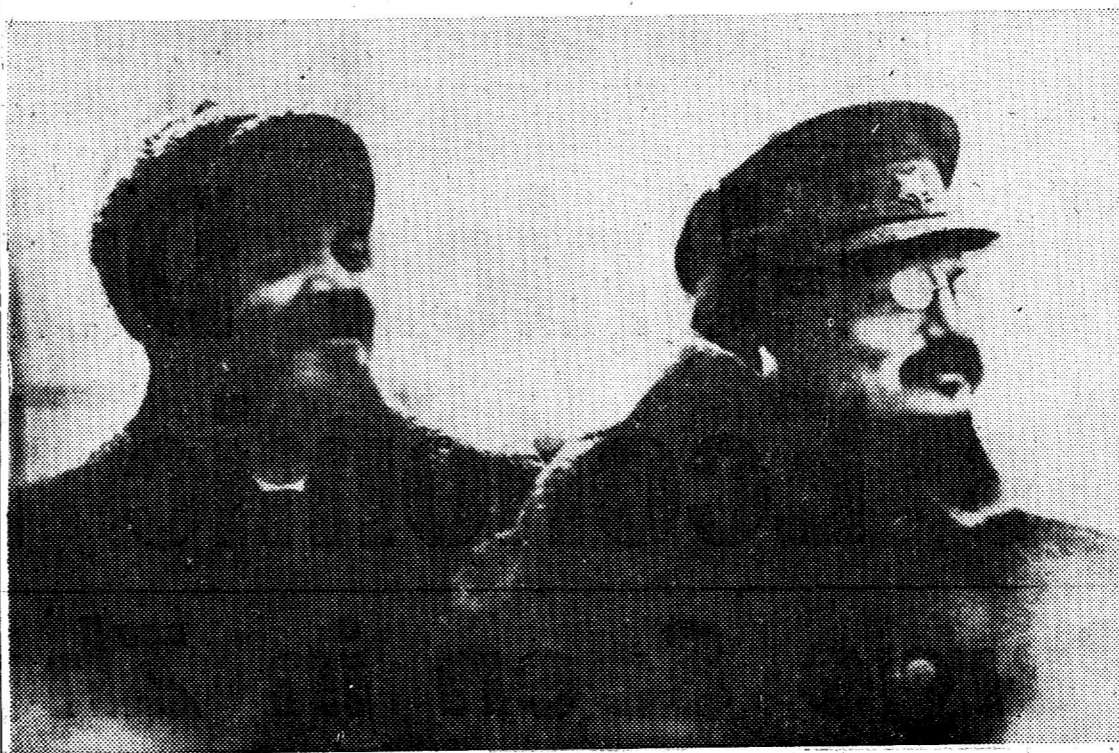
LENIN (left) and TROTSKY together led the Russian working class to victory in the revolution of 1917. The events that brought the workers to power for the first time were subsequently distorted and concealed by the Stalinist falsifiers of history. With the new upsurge of the Russian workers and youth, a search for the true history of these events has begun.

tested all leaders, all parties and all governments. The role of the Bolshevik party from February to October yields the only concrete lesson in the science and art of successful leadership of proletarian revolution that history has provided. We see not a band of power-hungry conspirators, as capitalist observers portrayed the revolution, nor a collegium of infallible priests, as Stalin represented the party of Lenin, but a living organism, correcting its mistakes, at times in a crisis atmosphere, functioning with direct ties to the workers' movement and capable of providing the organization for the whole class in its assault on capital.