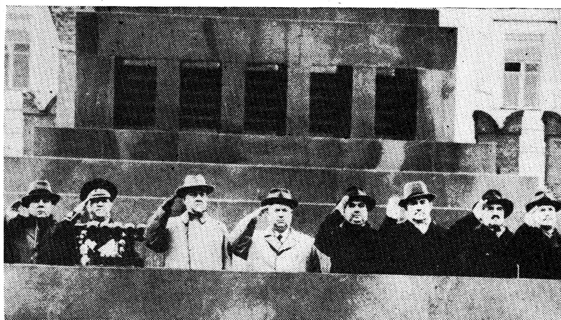
Ranks of top Kremlin bureaucrats continue to thin. Four of the above have been ousted since this May Day picture. From left to right: Vorozhilov, Zhukov (ousted), Bulganin, Khrushchev, Malenkov (ousted), Kaganovich (ousted), Mikoyan and Molotov (ousted).