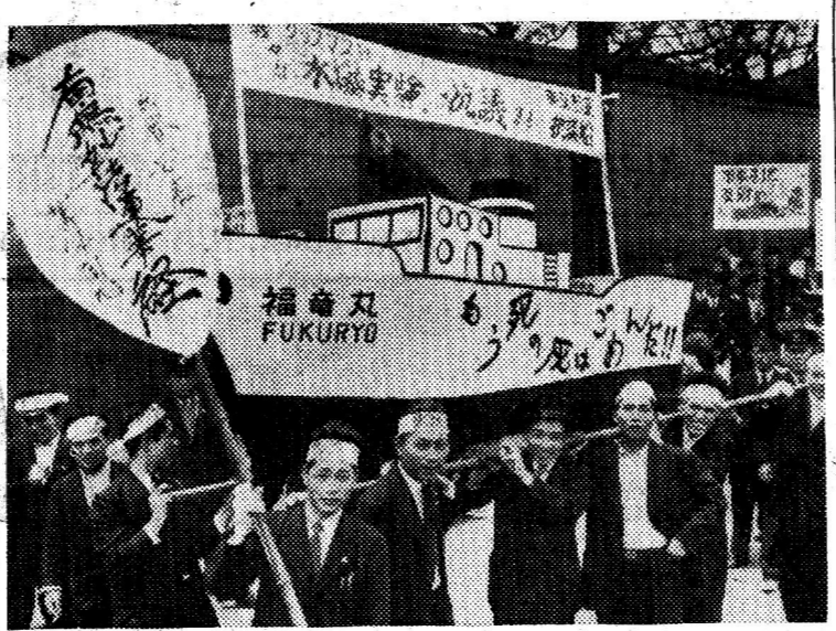
Japanese workers marching on May Day carried a float depicting the fishing boat that was sprayed with radioactive ash from a United States hydrogen bomb explosion in the Pacific in 1956. So far two of the fishermen on that boat have died of radiation poisoning.

Almost all Japanese working people have come to realize from their own experience the absolute destroying power of nuclear weapons. They are whole-heartedly against them. Thus the recent