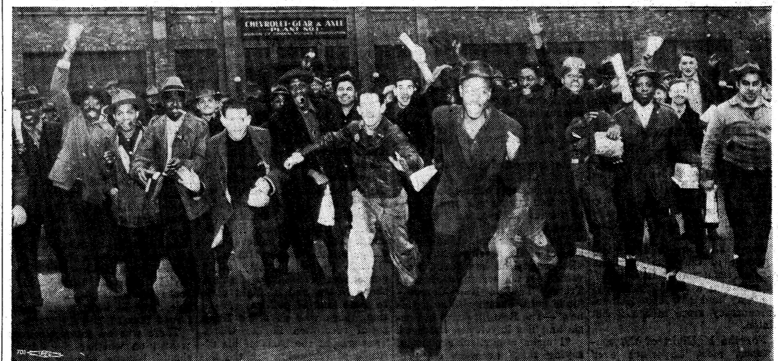
"Here they come!" Negro and white workers pour out of the Chevrolet Gear and Axle, Detroit's largest GM plant at 11 A.M., Nov. 21, 1945, to begin the famous post-war GM strike. Members of UAW-CIO in 102 plants throughout the country hit the bricks 225,000 strong for 113 days in the biggest industrial strike in U.S. history. Their solidarity broke the wartime wage freeze, won the biggest wage increase to that date, and smashed all hopes of Big Business to bust unions by pitting veterans against unions or white against Negro.