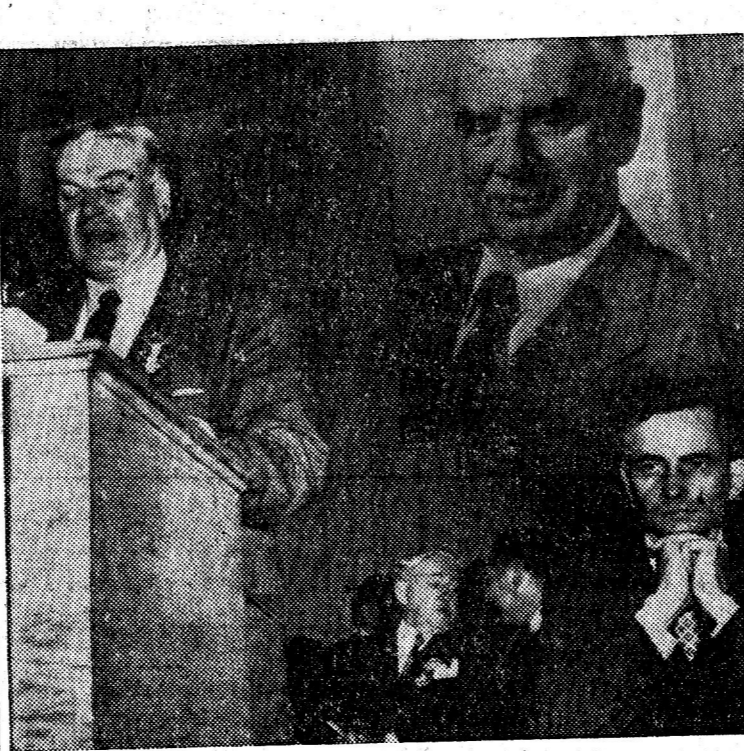
Acting Pres. David J. McDonald of the United Steelworkers reads report at recent CIO convention which elected Walter Reuther president following the death of Philip Murray. CIO Secretary-Treasurer James B. Carey sits in foreground. In rear are CIO Exec. Vice-President Allan S. Haywood and Secretary-Treasurer Emil Mazey of the United Auto Workers.

convention delegates. His speech in memory of Philip Murray was not a simple eulogy of the deceased CIO leader — it was much more than that. It was a policy message from the head of the Democratic Party, the official opposition party after next Jan. 22, to the trade unions from which it had received unqualified backing. The main theme of this message is contained in the following key sentences: