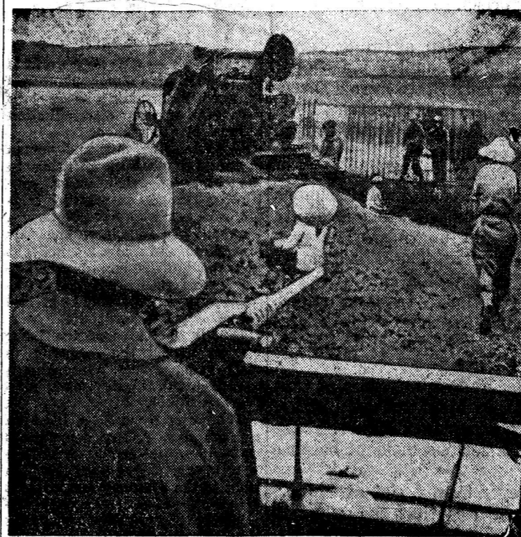
Working at gun-point, conscripted Indo-Chinese workers construct cement block-house fortifications for their U.S. armed French masters who have been warring since 1946 against the independence movement.

October 1952 in the attempt to re-seize Indo-China were reported on Nov. 20 by the French Ministry of National Defense at 28,246 killed and missing, with wounded equal several times that number. Troops of the Viet Nam puppet