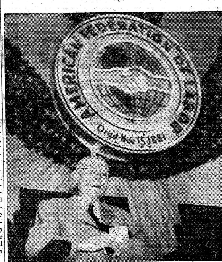
William Green, late president of the American Federation of Labor, shown presiding over the last convention of the AFL in New York's Hotel Commodore. At this convention, Green favored change in traditional AFL policy of hands off in presidential elections, gave backing to Stevenson.

shot them and framed the leaders. The principal cause of the failure of the strikes was hunger.