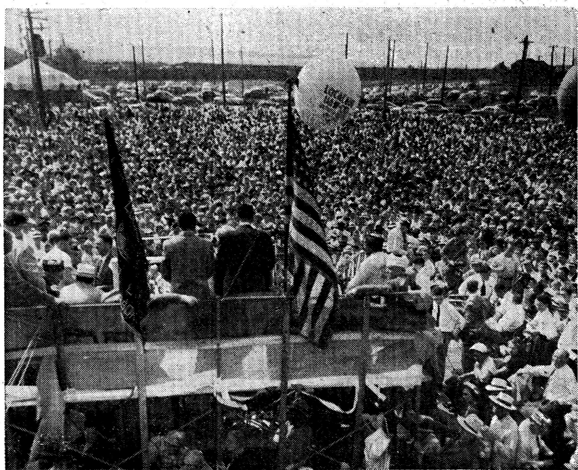
On its 10th anniversary, UAW-CIO Ford Local 600 held a mass rally, attended by 50,000 auto workers. John L. Lewis was the main speaker. Although they were invited by the local president to speak, CIO President Philip Murray, and UAW-CIO President Walter Reuther, refused to attend.

Reuther demanded that the auto workers boycott the celebration. But his orders were ignored. Lewis, opening his speech, declared that all that is needed to guarantee a successful rally, is have it boycotted by Reuther.