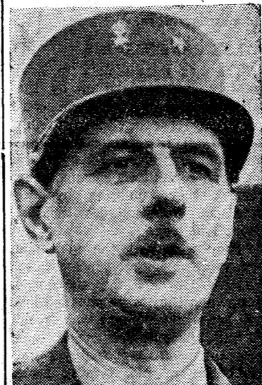
Gen. deGaulle, whose party emerged as a sizeable force in the recent French elections, represents a real danger to the French workers.

The indignities and humiliations suffered by women, men and children whose skin is tinted black are countless and as a rule, hushed up. They are a part of the scene in the North just as in the South; and are so much taken for granted that it takes some such flagrant "error" as the one committed in New Rochelle to bring this vicious race discrimination to the surface.