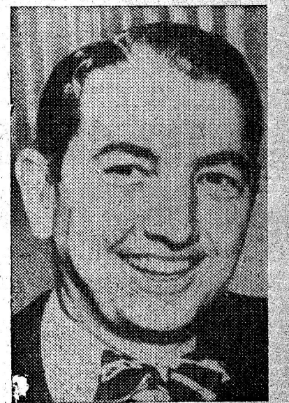
TOM C. CLARK

The Truman Administration, taking advantage of the hysteria aroused by the current spy scare, is drafting a bill to "tighten" the Espionage Act of 1917 as a weapon against working class political minorities and opponents of its militarism and war program. It was under the Espionage Act that thousands of anti-war socialists and labor leaders, including Eugene V. Debs, were railroaded to prison by the Wilson administration in World War I. Under this act, persons were given long prison terms merely for saying that it was a "profiteers' war."