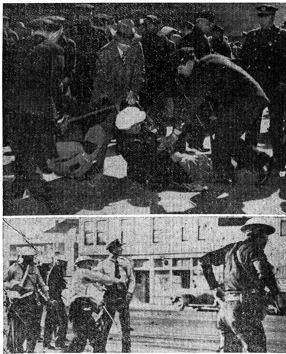
Strikes in 1948 under the Taft-Hartley regime were notable for the renewed pattern of police violence against pickets. AFL employees of the New York Stock Exchange were among the victims when the year was young (above), and CIO oil workers on the west coast were the targets toward the year's end (below).

There will be no peace—this is the gist of the report released Dec. 16 by the Eberstadt Committee. The document is of unusual significance since it outlines the basic ideas of the capitalist ruling clique on the