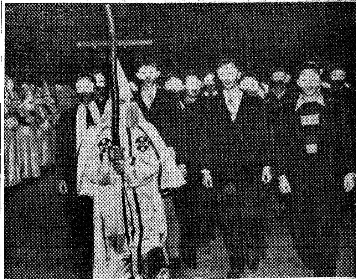
In a public ceremony at the city auditorium in Macon, Ga., the Ku Klux Klan initiates 300 new members, wearing eye masks. The Klan knows it has nothing to fear from either the Truman administration or the House Un-American Committee.