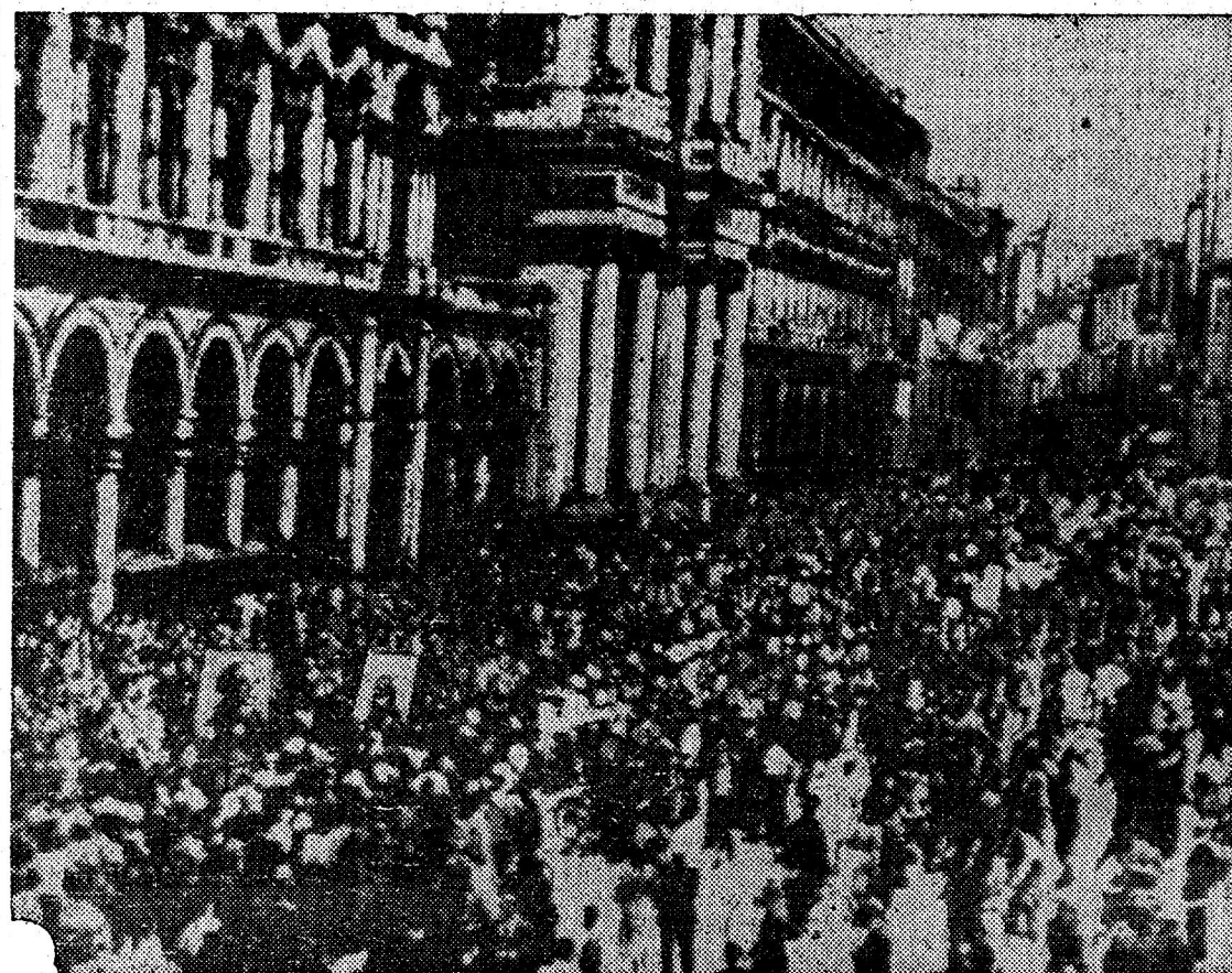
The above picture shows a huge anti-war demonstration being held in Piazza Domo in Milan shortly after the fall of Mussolini. The same scene was repeated in most of the other industrial cities of Italy as the masses came out into the streets to voice their demand for peace. In a number of instances the troops disobeyed orders to shoot at demonstrations of this kind because the anti-war demands being raised by the masses voice their own sentiments.