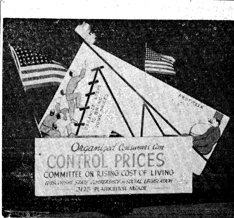
Milwaukee consumers used this float to agitate against the rising cost of living. It's OK—but the fight for the automatic adjustment of wages upward as the cost of living rises is the basic method for the worker-consumer to beat the bosses' game.

But this cut no ice with the corporations. They knew that any threat to commandeer plants—and the threat was