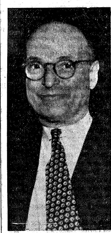
Tom Girdler, head of the Republic Steel Corporation at whose Chicago plant occurred the bloody Memorial Day Massacre during the Little Steel Strike of 1937, has at last been brought to his knees. The great Bethlehem Steel strikes and the relentless organizational drive of the Steel Workers Organizing Committee (CIO) has forced him to agree to recognize the union and sign a union contract.