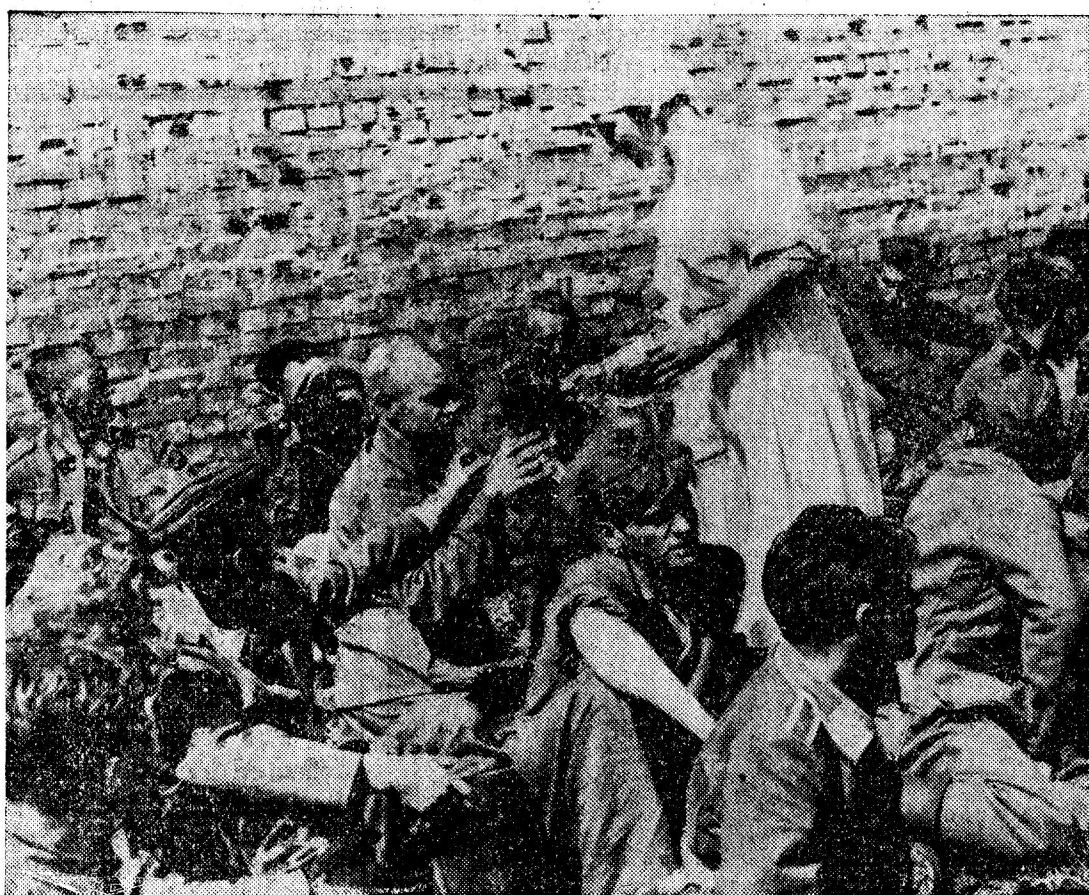
German soldiers taken prisoners by the Red Army, receive water from a Red nurse before being sent to the rear.