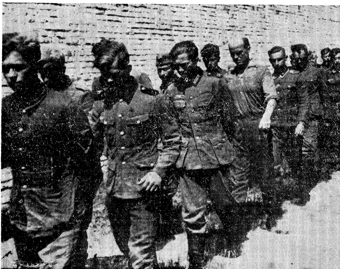
All the "blitz" has been taken out of these Nazi troops captured by the Soviet Army. They are shown in this radiophoto from Moscow as they are being moved to the rear under the guard of Red Army troops.