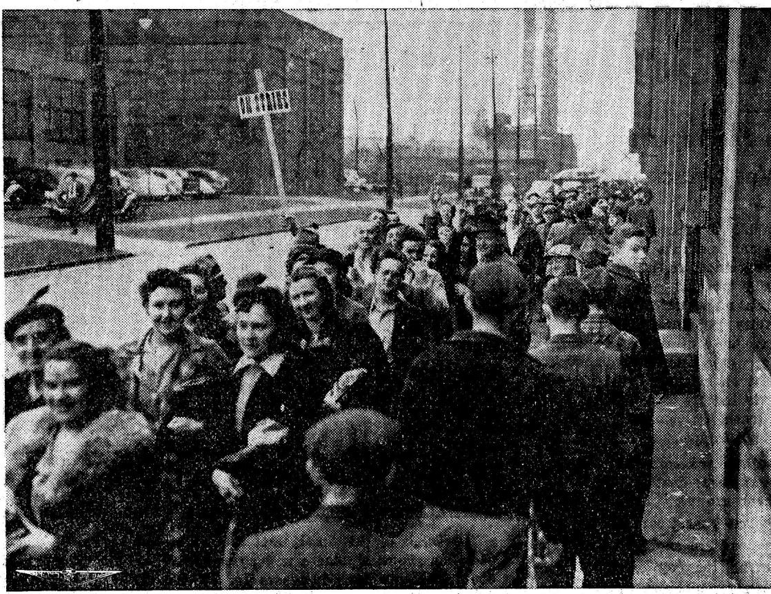
Mass picket line before the main plant of the Hudson Motor Car Co., Detroit. 8,500 members of the United Automobile Workers (CIO) last week went on strike at three plants of the company in support of a demand for wage increases of 15 cents an hour.