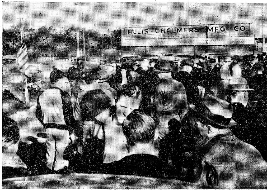
Picketing the struck plant of the Allis-Chalmers Mfg. Co., in La Porte, Wisconsin, where 950 members of the Farm Equipment Workers Organizing Committee (CIO) recently staged a walk-out. The strike ended after the union agreed to submit the issues to the National Mediation Board.