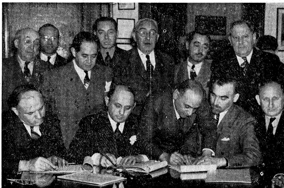
Officials of the Amalgamated Clothing Workers (CIO) and the Clothing Manufacturers Association shown signing a new agreement which the union heads claim will provide some $18,000,000 in annual wage increases for 135,000 clothing workers.