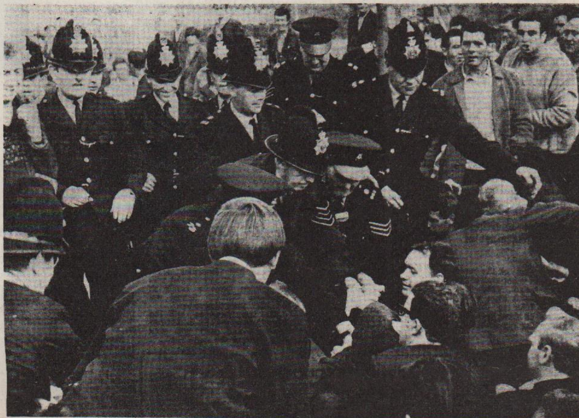
Police waded into pickets at the Chemico site, but the building workers staged a defiant sit-down