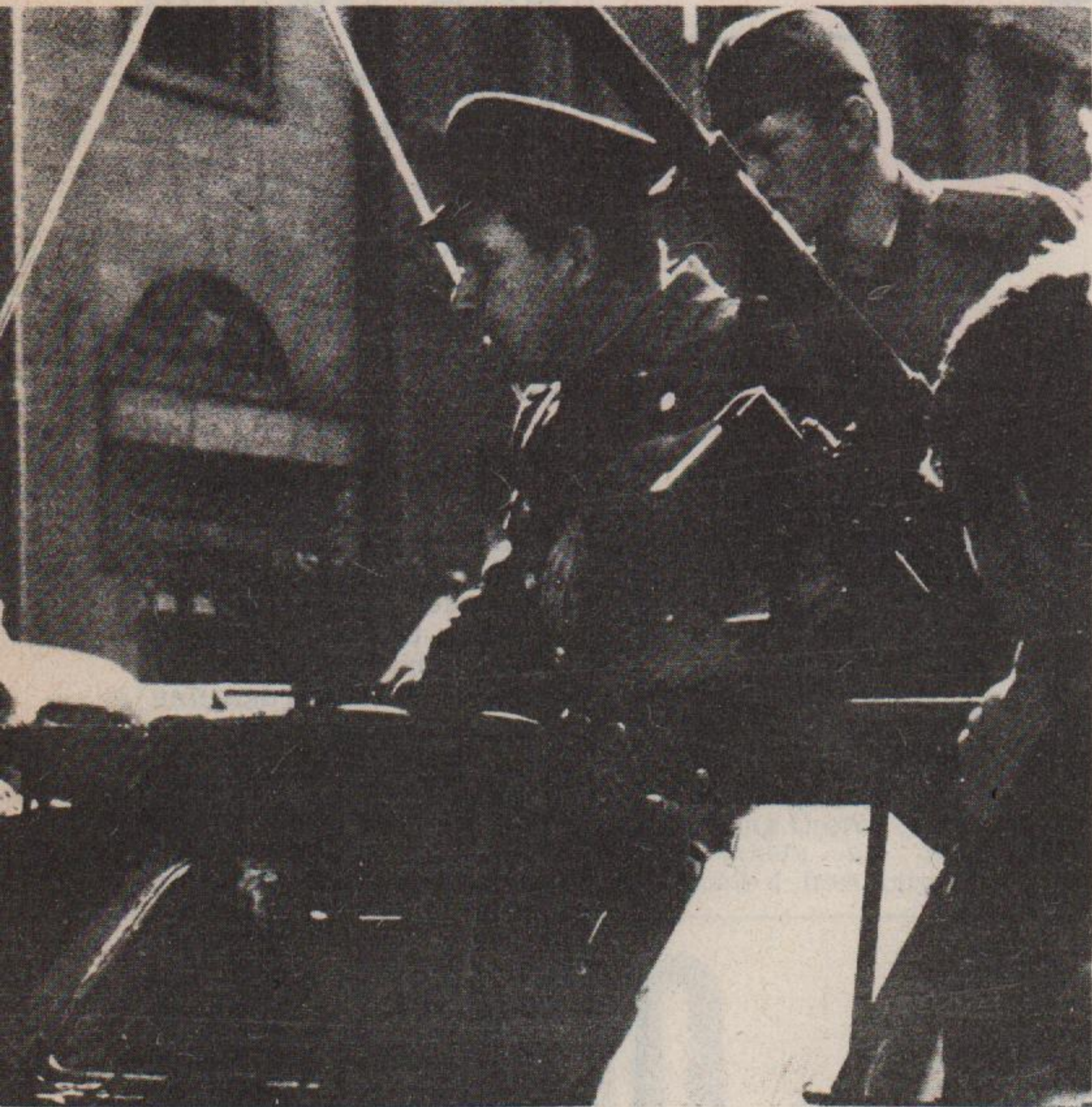
'Why have you come?' Young Czechs climbed on to Russian tanks during the invasion to question the soldiers.

They seem to be in two minds, not knowing whether to fragment the local middle-class and settle in as the only stable conservative force; or to strengthen and solidify them, and withdraw.