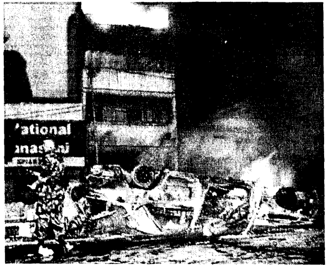
Racist pogroms torched Chinese neighborhoods.

“ The Communist Party can and should formulate the slogan of the constituent assembly with full powers, elected by universal, equal, direct, and secret suffrage. In the process of agitation for this slogan, it will obviously be necessary to