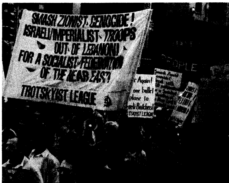
Toronto September 25. TL contingent protests Israeli-engineered slaughter in Shatila and Sabra.

The Hebrew-speaking working people must be broken from Zionism and the deep-going racialist