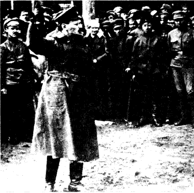
Trotsky addresses the Red Army during revolutionary war against Pilsudski's Poland. Today the fascistic inter-war dictator is counterrevolutionary Solidarność' hero.

The Soviet Union can be best understood as a great trade union fallen into the hands of corrupt and degenerate leaders. Our struggle against Stalinism is a struggle within the labor movement. Against the bosses we preserve the unity of the class front, we stand shoulder to shoulder with all workers. The Soviet Union is a Workers' State, although degenerated because of Stalinist rule. Just as we support strikes against the bosses even though the union conducting the strike is under the control of Stalin-