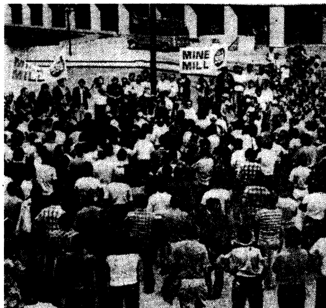
Sudbury: "unemployment capital of Canada," miners demonstrate against Falconbridge layoffs, September 1982.