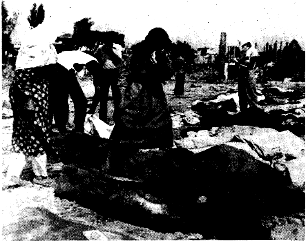
Imperialist "peacekeepers" set stage for massacres by disarming and expelling PLO fighters.

In demonstrations in Vancouver and Toronto September 25 Trotskyist League contingents participated with placards demanding: Smash Zionist Genocide! Defend the Palestinians! Israeli/Imperialist Troops out of Lebanon! For a Socialist Federation of the Near East! In Toronto our chants of "Deir Yassin—Never Again! Tel Zataar—Never Again! West