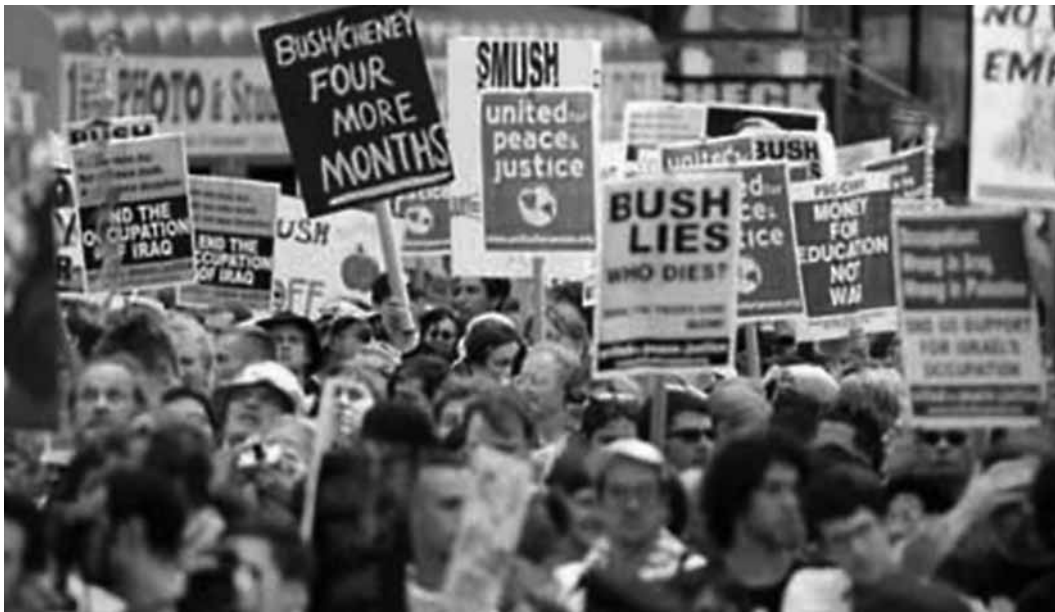
New York, August 29. Enormous demonstration against Republican National Convention. Majority of protesters showed misguided hopes in Kerry and Democrats.