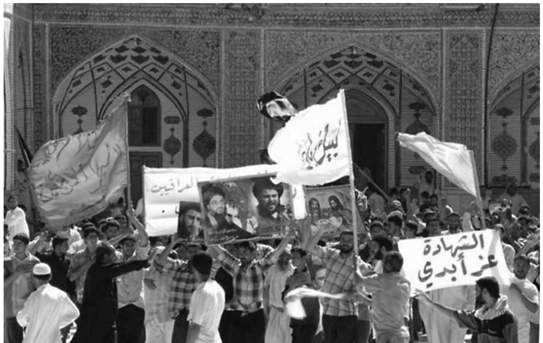
Insurgents rally inside the Imam Ali shrine.

Allawi did everything in his power to act tough. The most prominent act his government undertook in its first weeks of existence was the security law announced July 7, which allows the puppet regime to declare a state of emergency and impose martial