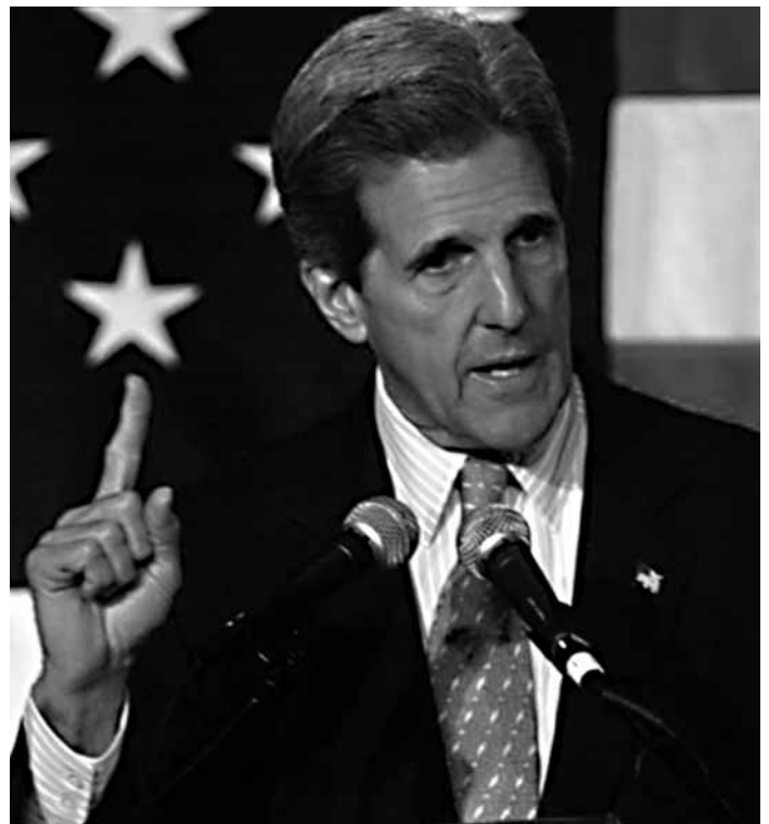
Democratic Party imperialist John Kerry differs from Bush on how U.S. got into Iraq war but agrees on "staying the course" of the occupation.

Kerry's successful run through the Democratic primaries, overtaking the early "anti-war" frontrunner Howard Dean, was