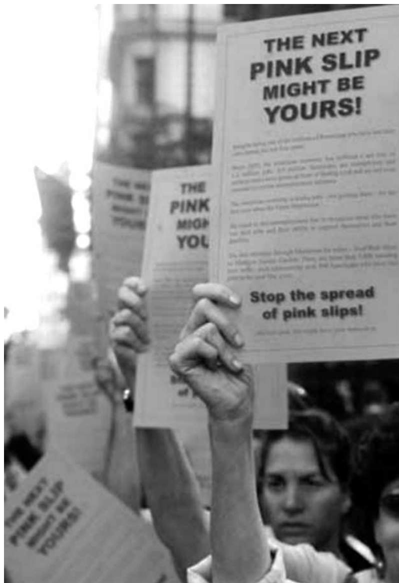
Demonstrators protest layoffs during Republican Convention. Labor bureaucrats denounced Bush's economy but squelched mention of Bush and Kerry's wars on Afghanistan, Iraq.

And the rulers feel no such compulsion. Despite mounting mass suffering and resentment, the class struggle in this country has been relatively contained, with workers and their allies clearly on the defensive. A primary reason for this is that the misleaders of the trade unions and the Black, Latino and immigrant organizations refuse to organize and lead a mass militant opposition to capitalist attacks. Tied materially and ideologically to the capitalist system and fearing the consequences of mass struggle, they have suppressed militancy in their ranks and conducted sellout after sellout. Typically they counterpose working through the electoral process – usually meaning supporting Democrats – to militant social struggle.