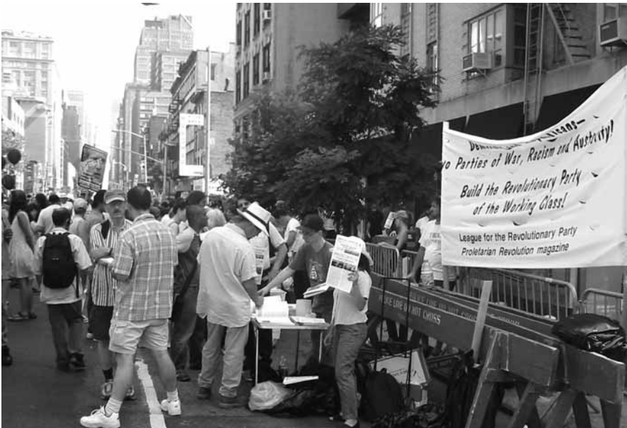
LRP literature table at August 29 rally. LRP banner and chants denouncing Kerry as well as Bush stood out against mood of "Anybody but Bush" crowd.

half a loaf which quickly crumbles, a struggle for socialist revolution and a whole new world is necessary. Instead of just threatening the system, the working class has to prepare for revolutionary struggle to overthrow it.