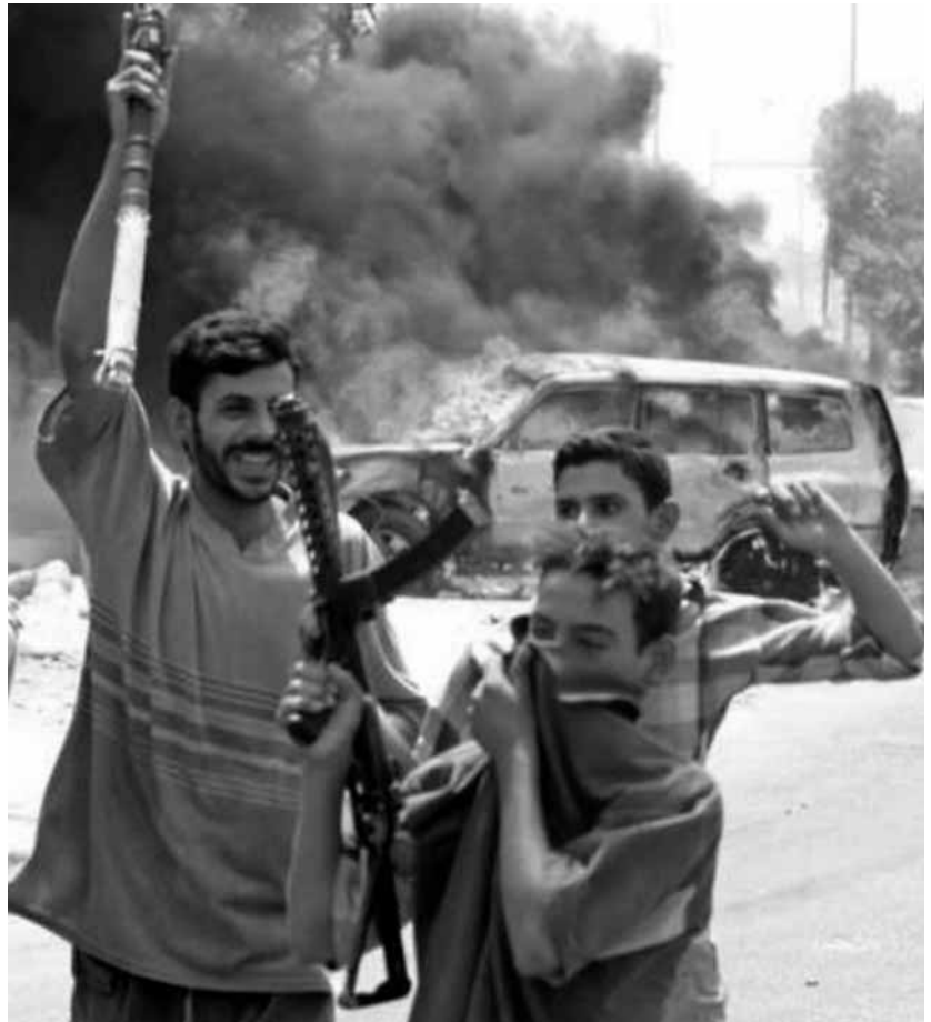
Iraqi militia celebrate near a burning British vehicle in Basra, August 17