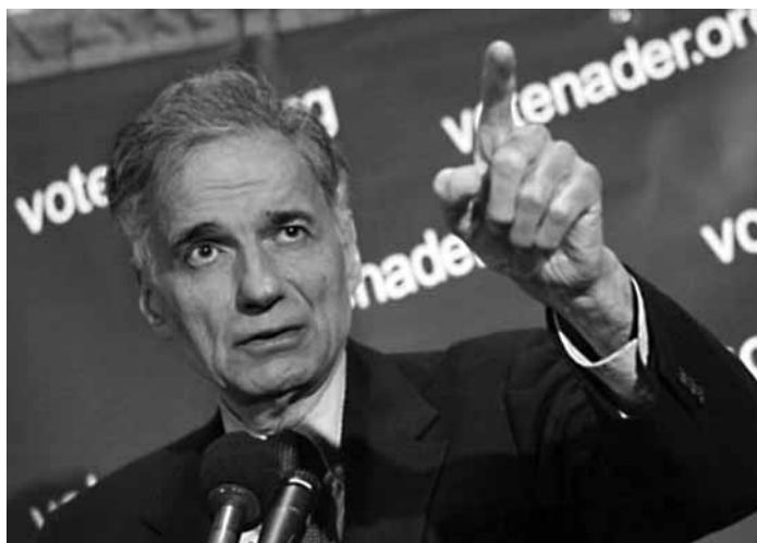
Ralph Nader, third capitalist candidate, favors occupation, opposes immigrant and abortion rights.

When the ISO finally joined the Nader campaign, it had a lot to say about what’s wrong with Kerry but apparently found it so difficult to find something right with Nader that it had to lie to do so! Socialist Worker’s August 6 editorial, “Bush vs. Bush Lite; Where’s the choice?” – the ISO’s first public endorsement – mentioned Nader as an afterthought: “We don’t have to accept a choice between George W. Bush and Kerry’s copycat policies. Nader and Camejo are giving a voice to the vast majority left out