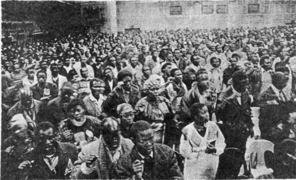
Mass attendance at CWIU branch general meeting in NE Transvaal.

The four members charged were called to the inquiry without the minimum notice due under the union constitution. When some of those charged informed the inquiry that they could not attend on such short notice, the leadership simply went ahead with the inquiry in their absence, finding all four guilty. As if the political character of this witch hunt was not already obvious, the punishments were clearly delivered according to whom the bureaucracy considered the most politically threatening. Agulhas was not only removed from the union presidency but was also suspended from being a steward for five years, while two of the others found guilty of the same charges received warnings, and one was not punished at all.