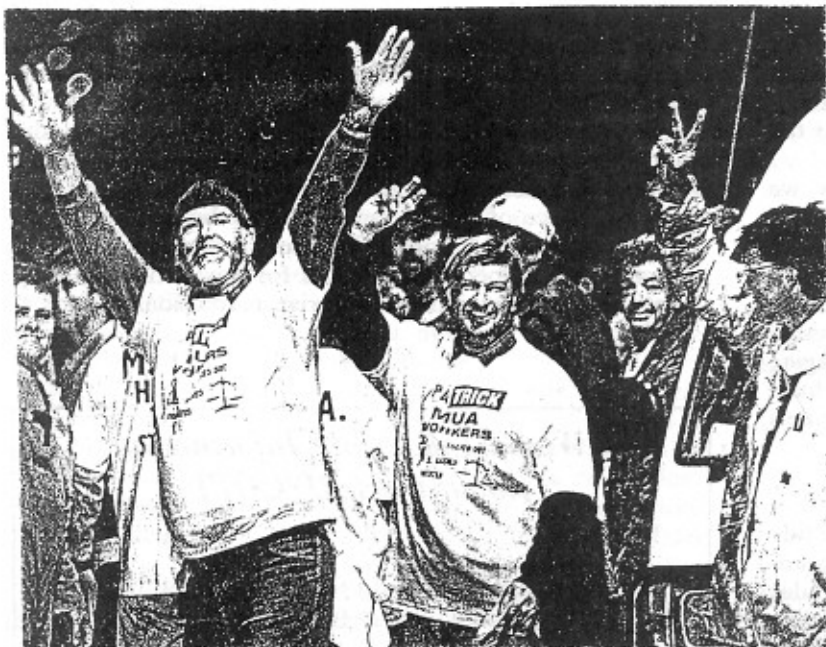
Melbourne wharfies' victory celebrations were premature, as union leaders later sold them out to bosses.

Although the wharfies were the bosses' first target, this pro-capitalist perspective was openly embraced by the leaders of the waterfront workers. They cooperated with the Labor government's 13-year program of "waterfront reform," which saw the