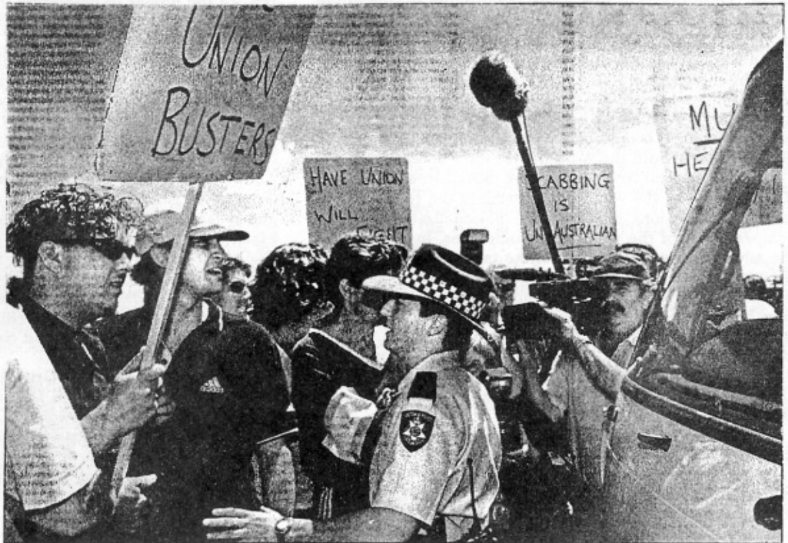
Cops clear way for company guards and scabs at Patrick's dock in Melbourne.

As we have detailed, this is precisely what the MUA leaders have agreed to.