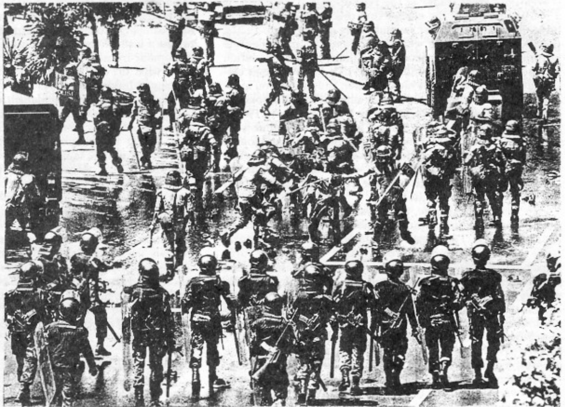
Indonesian riot police battle anti-Suharto protesters.

for Megawati of the PDI to be president. This year, when the mass upsurge broke out in May, the PRD demanded that Suharto be replaced by an opposition government; it proposed participation by Megawati, Amien Rais, head of the Muslim mass organization Muhammadiyah (who has reportedly encouraged attacks against ethnic Chinese), Budiman Sudjatmiko, the chairman of the PRD and the chair of the PPP, both of whom are still in jail.