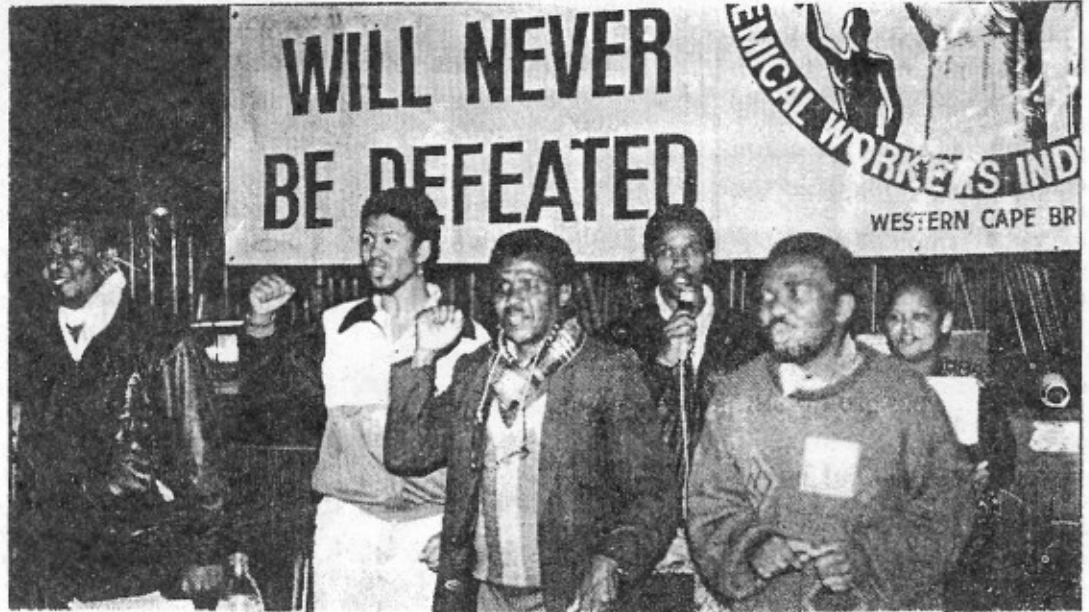
CWIU leaders at Cape Town conference.