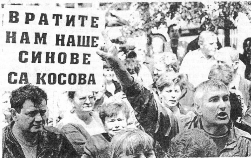
Protest by hundreds of parents of Serbian soldiers sent to Kosovo in June. Rally demanded, "Bring back our sons from Kosovo."

This means defending the Kosovars' right to self-determination, the right to choose their own national status. In this case it is abundantly clear that their choice is independence from Serbia. We do not automatically advocate independence for an oppressed national minority, but in this case the repression is so severe that we not only defend their right to choose independence, we advocate it as the only possible choice as well.