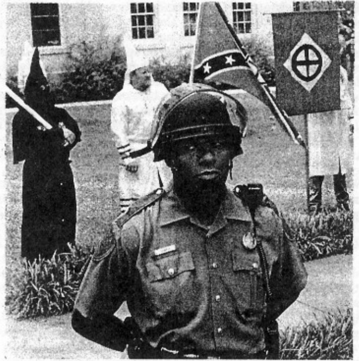
Cop guards Klan rally. Police are breeding ground for future mass fascist movement.

We have to overthrow capitalism and replace it with a proletarian dictatorship. If capitalism is allowed to continue