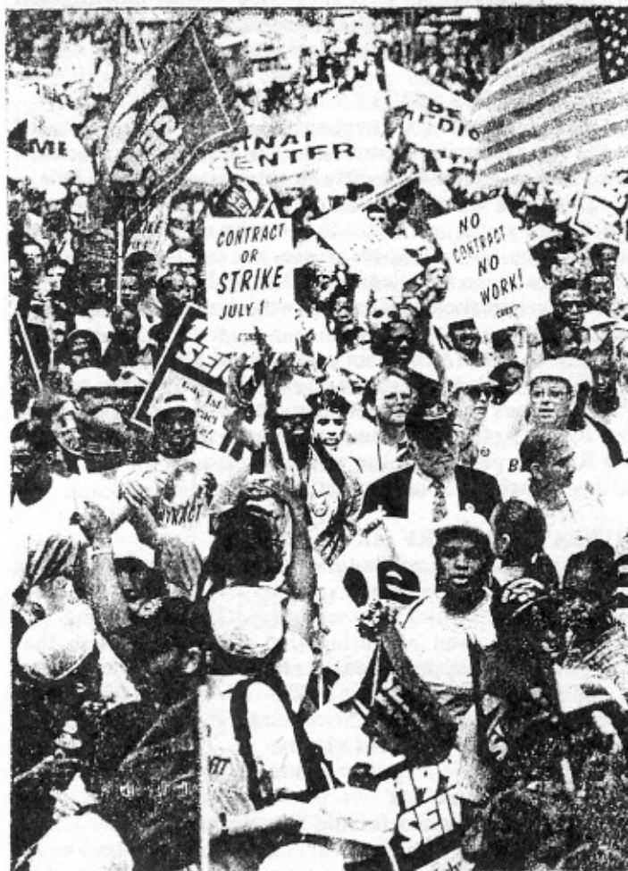
1199 members rally in Times Square, June 18.

As with the UAW and other unions, Rivera's strategy of accepting downsizing to avoid a confrontation means that jobs will be lost and the union weakened, leaving workers at a disadvantage in fighting the next round of attacks. Nevertheless, while Rivera took advantage of the fear and demoralization within the ranks, a mood he is largely responsible for, it is inevitable that workers will rebel against these cutbacks. The LRP is fighting to build an opposition that can put a halt to all such sellouts.