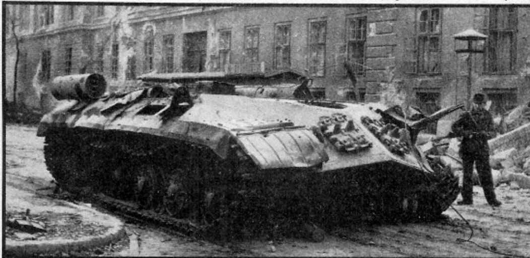
Budapest 1956: The Hungarian revolution shattered Stalinist tanks. To achieve success it had to shatter Stalinist state.

The WP-IWG would have to answer that the Stalinist states do not carry out all the fundamental tasks of a workers' state. They are, after all, only "degenerate." Yes, they eliminate capitalism — but they are an "obstacle" blocking the road to