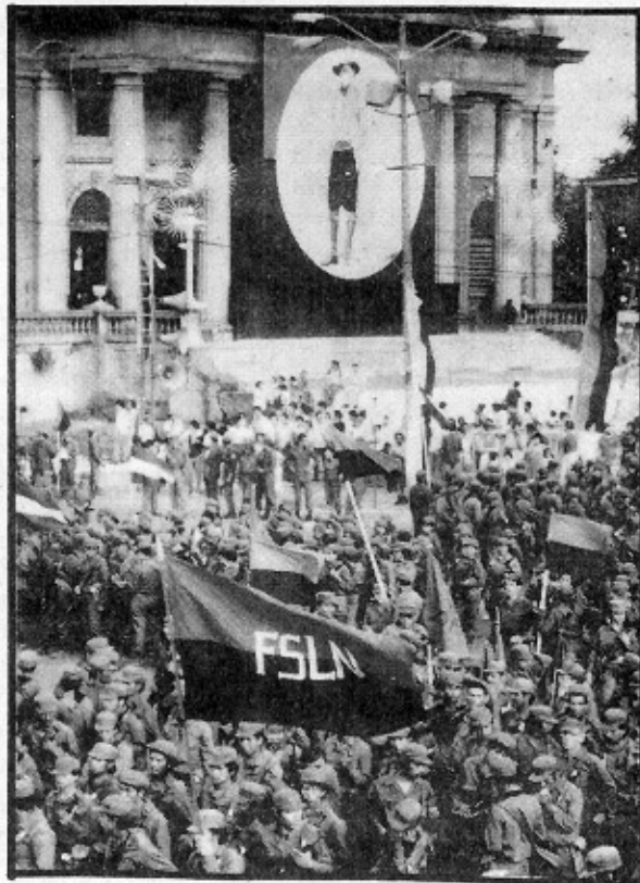
Sandinista demonstration in Nicaragua. Regime walks tightly between revolutionary masses and need to defend capitalism. Its fall is inevitable.

The process of strangling the Nicaraguan economy is bound to escalate. Reagan recently called for a blockade of sugar imports from Nicaragua. But the Sandinistas will never willingly cancel the debt, which would mean breaking their ties with capitalism. But for the Nicaraguan masses, debt