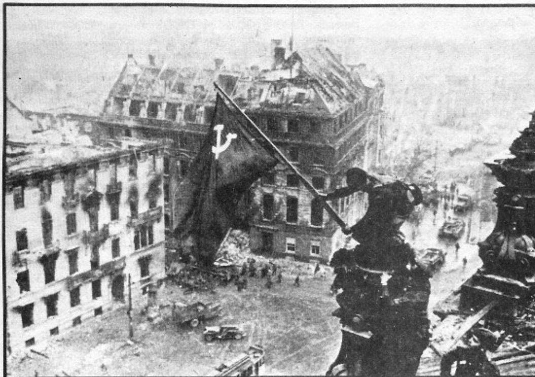
1945: Russians plant their flag on the Reichstag in Berlin. Hammer and sickle once symbolized the revolutionary workers' state. In post-World War II Europe it was used to crush workers' hopes.

The Pabloite dilemma is a problem for Pabloism but not for Marxism. Since the USSR was already capitalist, there is no difficulty in seeing its conquests as capitalist as well. In seizing state power from the Nazi and puppet regimes of Eastern Europe, the Soviets carried out political revolutions, changing the governments within the framework of continuing capitalist state power. It has happened many times in history that one sector of capitalism needed to use force and even revolutionary measures to take over the government from another sector. In the 1940's, the Stalinists first found it useful to govern capitalism in partnership with elements of the old bourgeoisie; later, when pressure from Western imperialism increased and was channeled through the traditional