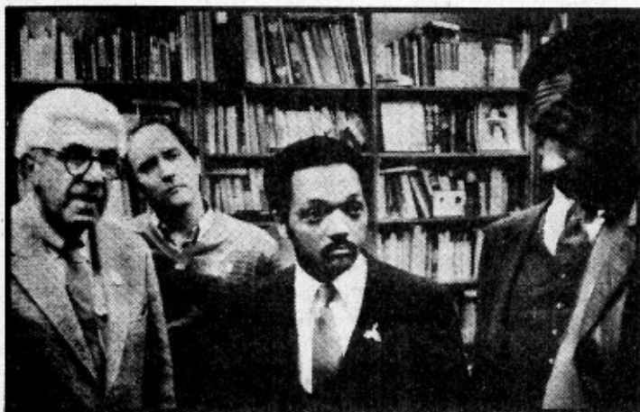
Jesse Jackson in New Hampshire synagogue to apologize for "Hymie" remarks. Barry Commoner, on left, was 1980 "independent third party" candidate.