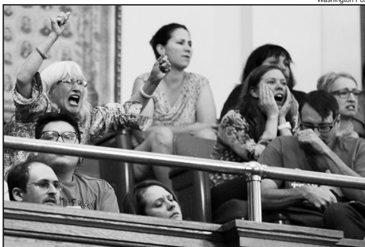
(Left) Pro-choice activists filled the gallery of the Texas state capitol while Sen. Davis delivered her filibuster.