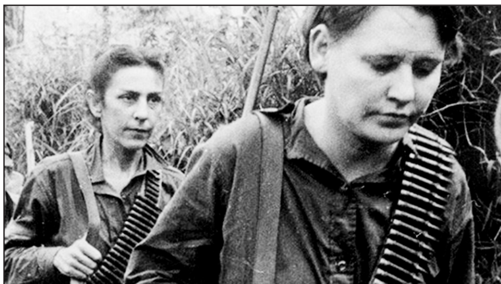
Celia Sanchez (left) with Haydee Santamaria in action as guerrilla fighters in the Sierra Maestra.