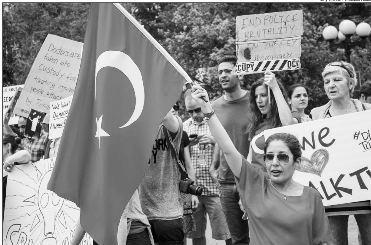
(Left) New York City demonstration in solidarity with pro-democracy protesters in Turkey.