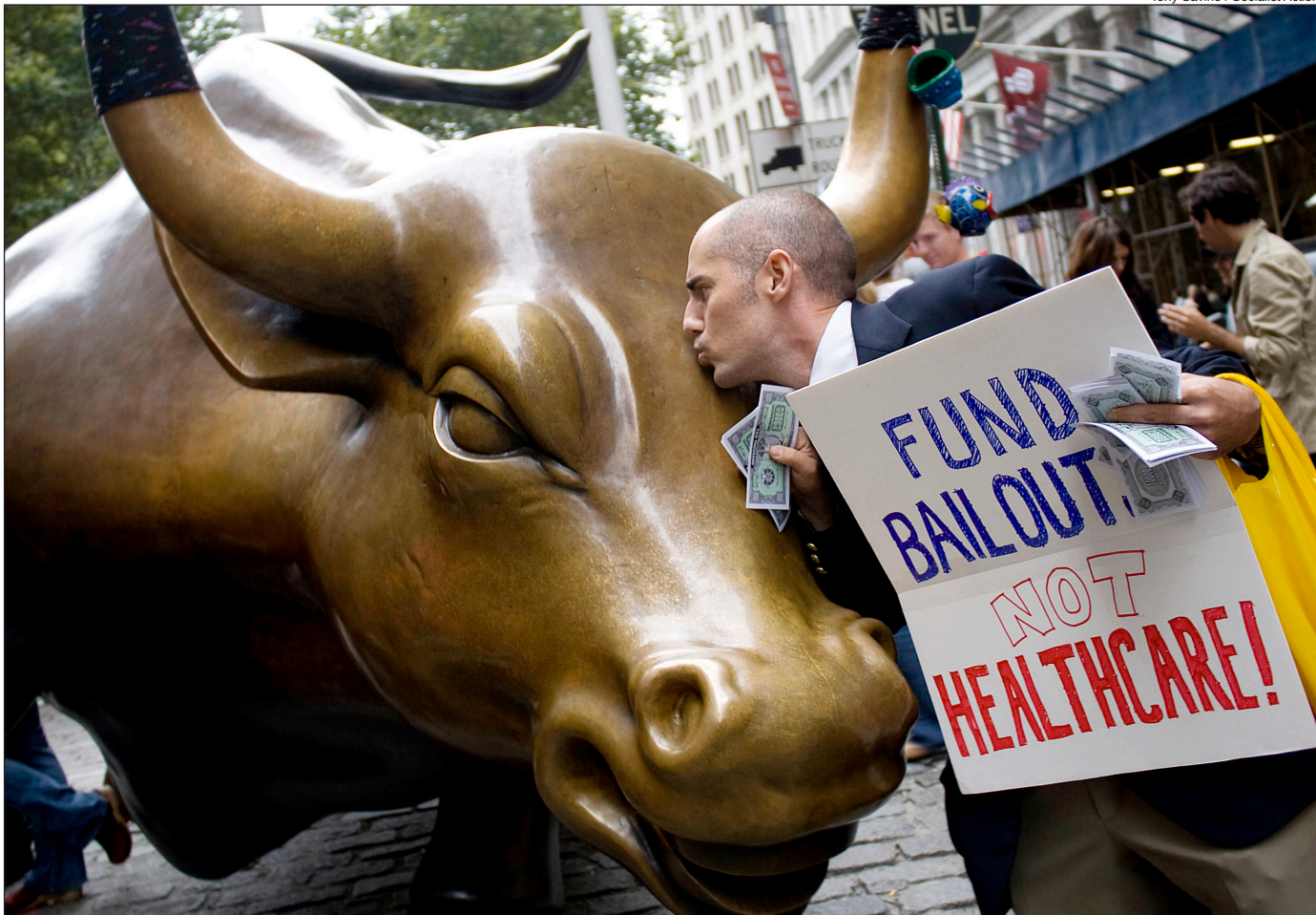
(Left) Actors parody the bankers at Wall Street protest in 2008.