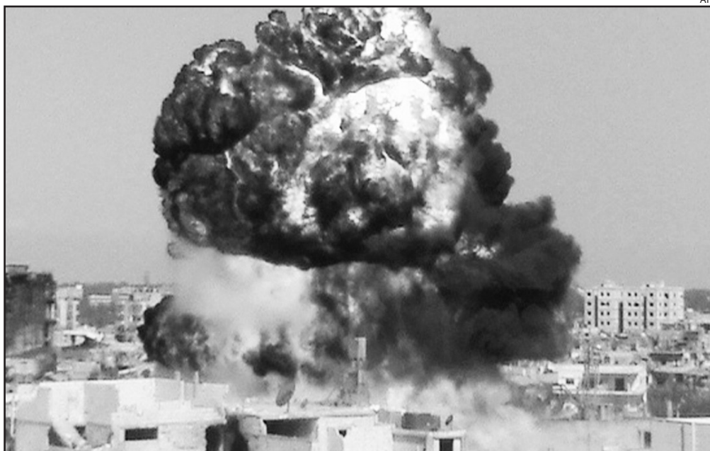
(Above) Photo taken by resident that purportedly shows a bomb explosion in the Syrian city of Homs, July 22, 2012.

AFI3RM All-African People's Revolutionary Party (GC) Alliance for a Just and Lasting Peace in the Philippines Arab Americans for Peace Arab Americans for Syria - AA4S BAYAN USA CRI-Panafriain