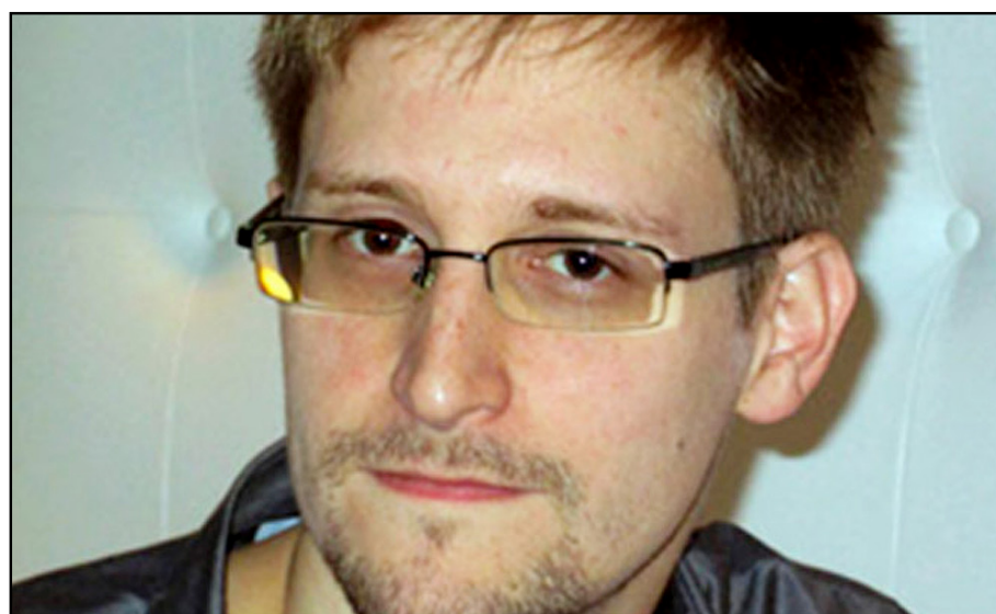
(Left) Edward Snowden.

the avalanche of crude, brutal, illegal, unconstitutional, racist and even genocidal measures that today define the daily ruling-class policies and practices of a declining social order. The president's speech was prompted by recent