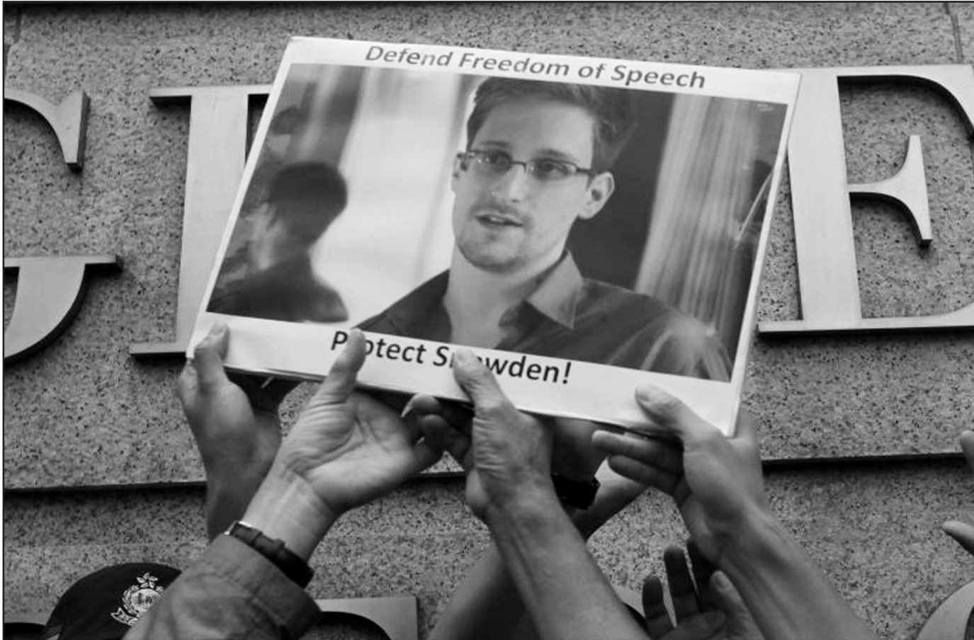
(Left) Rally participants in Hong Kong hold up photo of Edward Snowden.