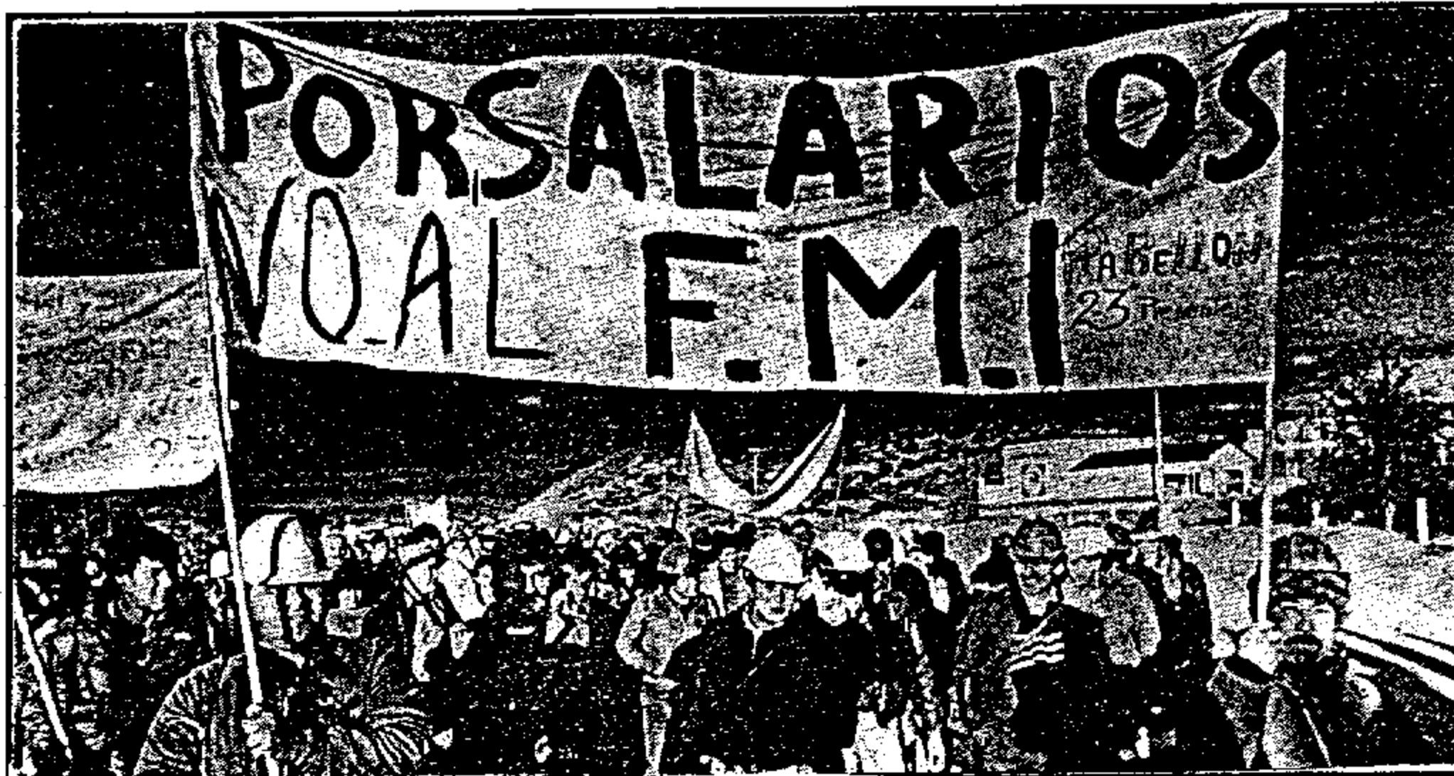
Latin American Workers Demanding, "For Wages not to the IMF"

In Mexico, for the first time in fifty years the Institutional Revolutionary Party (PRI) was faced with the possibility of being defeated in the elections last July and was forced to resort to fraud to remain in power. This provoked a wave of anti-government demonstrations which reached a new stage in November when the Government had to use the police to repress the demonstrations of the opposition in the run up to the election for Governor in the State of Tabasco on 8th November.