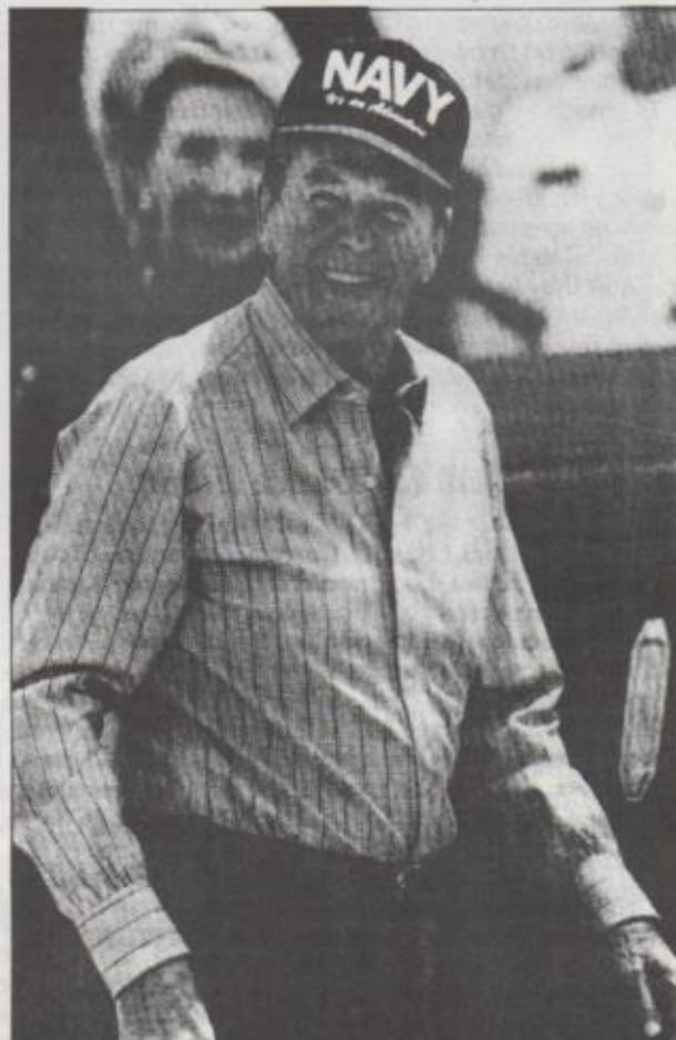
Reagan — pushing through aid for "contras".

Nor is this the first such provocation by the US Navy. The last 5 years of Ronald Rambo's Presidency have seen no less than 35 deliberate