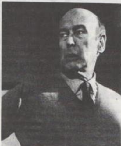
Right wing leaders Lecannet and D'Estaing

group the biggest in the National Assembly. The coalition of the Right has not achieved its objective. Its majority remains fragile and its leaders divided. The PCF is in decline, victim of its divisive policies. The FN is not doing as well as in the last European elections.