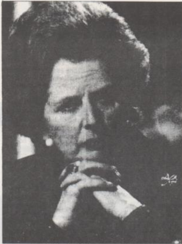
Leader of the Pack: Thatcher

some bloodletting to hit the headlines in order to raise the temperature for forcing through his aid package to the Contras.