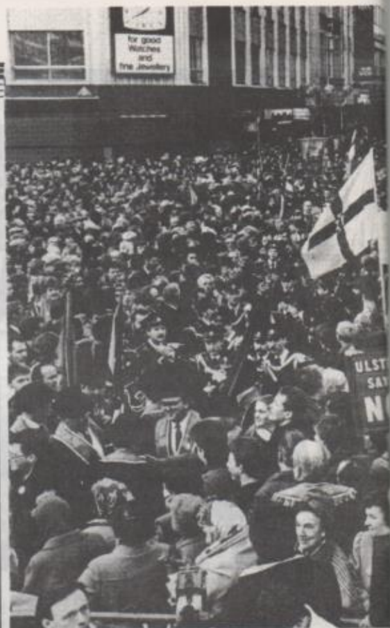
At Lurgan, 250 women textile workers were stoned and their factory eventually set on fire. Another factory was besieged at Moira and a bus burnt while the nationalist areas of Portadown were virtually cut off by

The March 3 strike showed that it was not "the politicians" who were in control, as pickets of the Ulster Clubs and UDA brought the province to a virtual standstill, attacking Nationalist workers and throwing up road blocks.