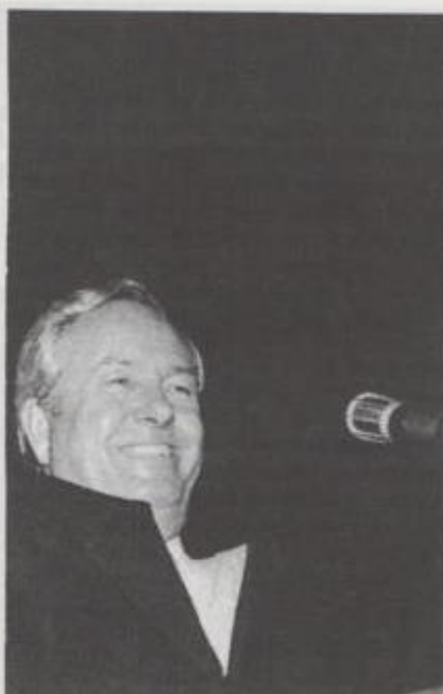
Fascist leader Le Pen, winning business backing.

While some analysts tend to dismiss these fascists as an inflated phenomenon brought about by the newly-introduced proportional representation, the score they realised in the South of the country is a reminder they are here to stay — 25% in Perpignan, 22.5% in Marseilles. As long ago as the last European elections they put to the test for the first time their shiny new electoral machine covering all constituencies. They have now built a small but significant base and obvious business