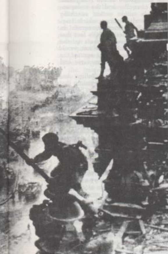
Soviet troops raise the Red Flag over the Reichstag at the end of World War 2: the post-war period demands a development of the Trotskyist programme of 1938.

Lenin, too, developed much of the political strength which enabled the Bolsheviks to take power from a serious appraisal of the experience, and practice of the existing Marxist movement in its various forms — not least the defeats and betrayals it suffered. Lenin's insistence upon the need to smash the capitalist state machinery and replace it with a workers' state — a dictatorship of the proletariat — arose from his renewed study of the defeated Paris Commune. The study of the failed Revolution of 1905 brought forward the importance of the soviet as the independent organ of workers' power in challenging the state. It also trig-