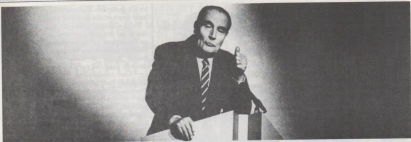
Mitterrand: thumbs up for the future?