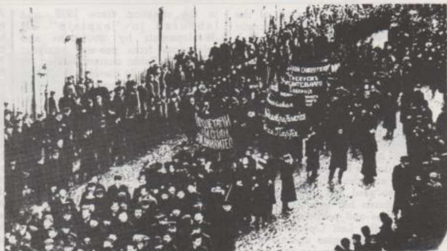
Lessons of the defeat of failed Russian 1905 revolution helped Lenin and Trotsky prepare for 1917.

Unless we seek to analyse and explore the lessons of history from the standpoint of actively developing a movement in the working class today, it has no value. And while any fool