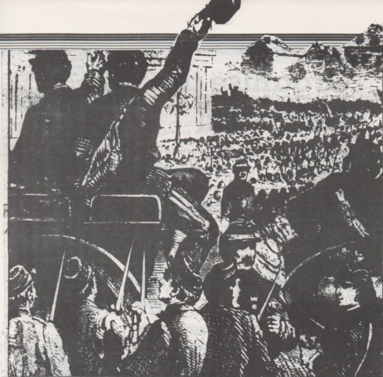
The Commune confirmed for Marx, Engels and Lenin the folly of reformist attempts to use the capitalist state machine

days of slaughter began. Men, women and children fought on the barricades as the bourgeois army forced its way across the city, culminating in the last stand in the cemetery Père la Chaise.