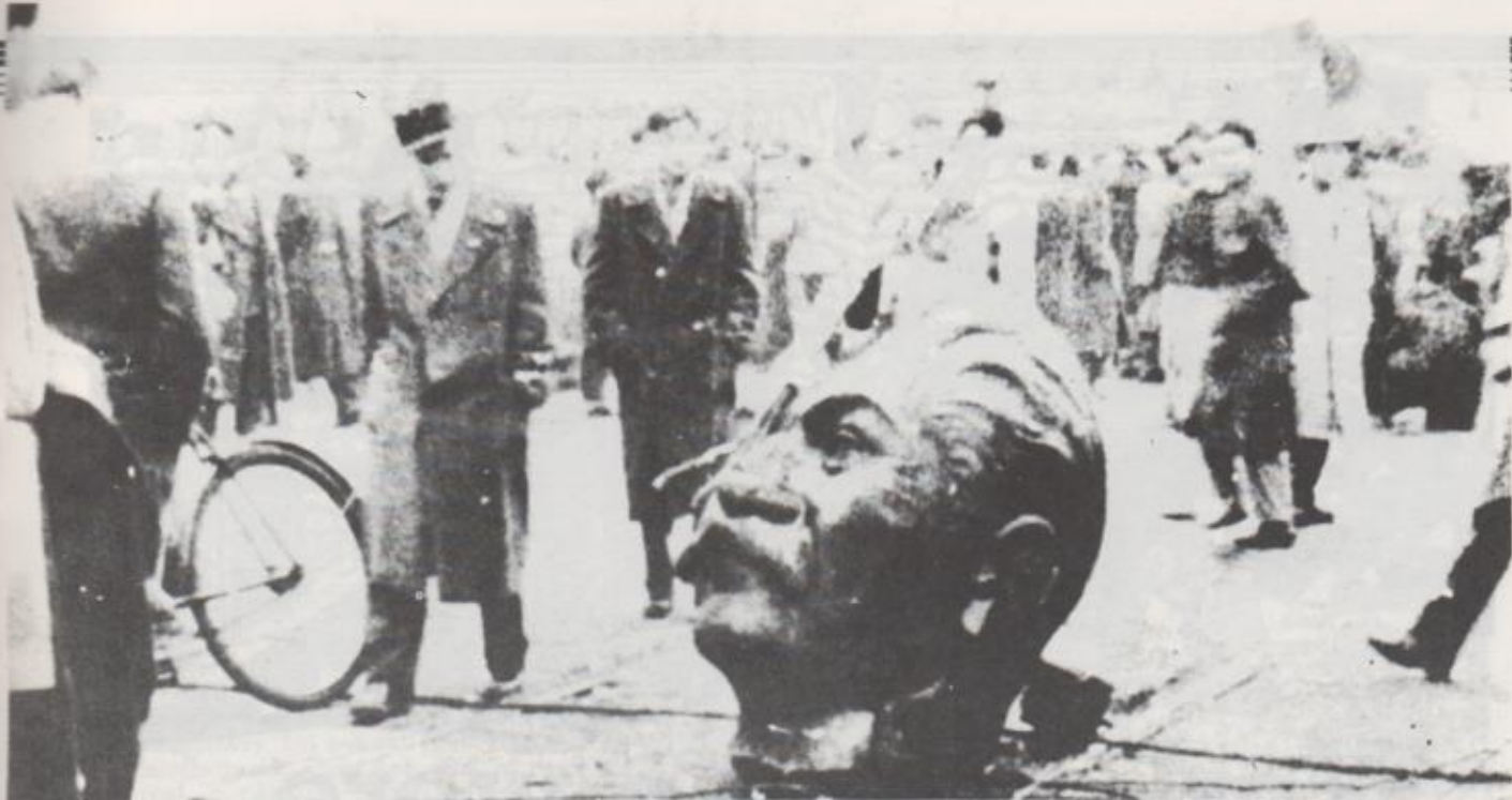
1956 Hungarian Revolution brought new concrete life to programme of political revolution.

of the mass movements of the day; with all its particular features, it is the raw material from which a new, more developed, more adequate programme must be developed.