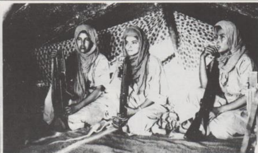
Sahraoui women have joined the armed struggle.

The tenacity and determination of the Sahraoui fighters made up for