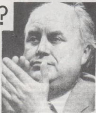
TUC sold out miners.

The British working class has lost all faith in its trade unions' ability to deliver even their immediate demands, let alone secure a better