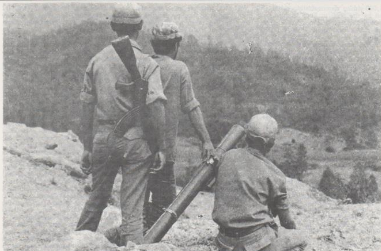
Defending Nicaragua's northern borders against "contra" raids.

ly or indirectly by the war. The present "survival economy" of Nicaragua allows for no state funding for new health or education building in the more heavily-populated "rearguard" pacific coast regions.