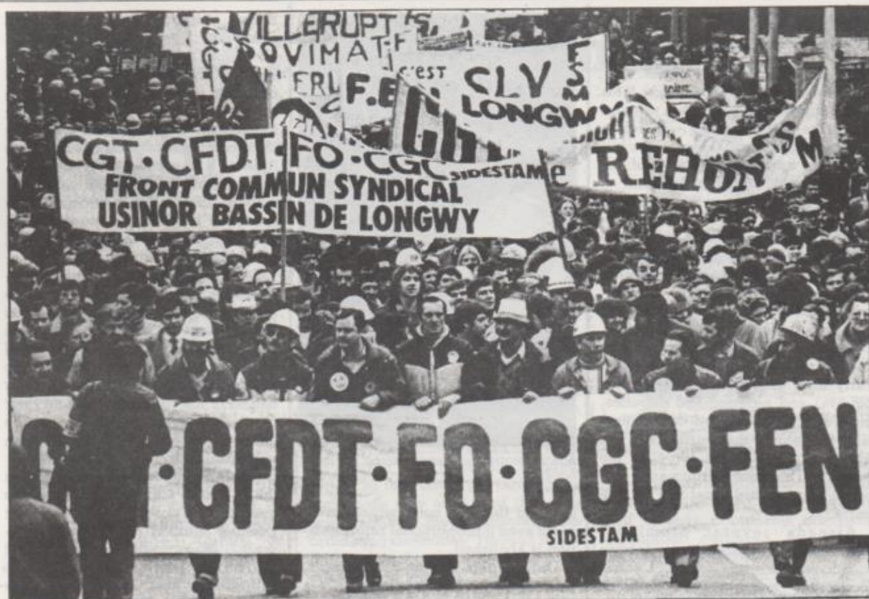
French unions under the hammer from Mitterrand's austerity measures.

tionalised giants (Rhone-Poulenc, PUK, CGE, St Gobain, Thomson) were picked from the ranks of the CNPF (equivalent of the CBI) and asked to draw up production plans "working towards maximum economic efficiency through the continual improvement of competitiveness".