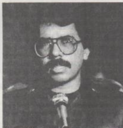
Nicaraguan President Ortega.

The above figures are from the government's claim against the US government presented to the World Court at the Hague. They should be set beside, for example, the view of the secretary of the Sandinista Trade Union Federation (CST) in León, that with this January's 40-90% national wage increases, wage rates are maintaining their value. Organised workers also benefit from distribution of basic goods through their trade union branches.