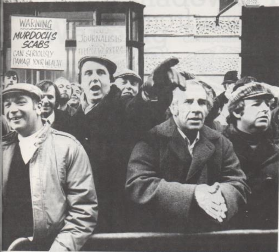
Printworkers lobby the TUC for support.

Kinnock must be forced to reverse his current disastrous stance of opposing the repeal of all Tory anti-union laws: this year's Labour Party conference must see resolutions spelling out a clear line of restoring the trade union rights and immunities crushed under the Thatcher/Tebbit machine.