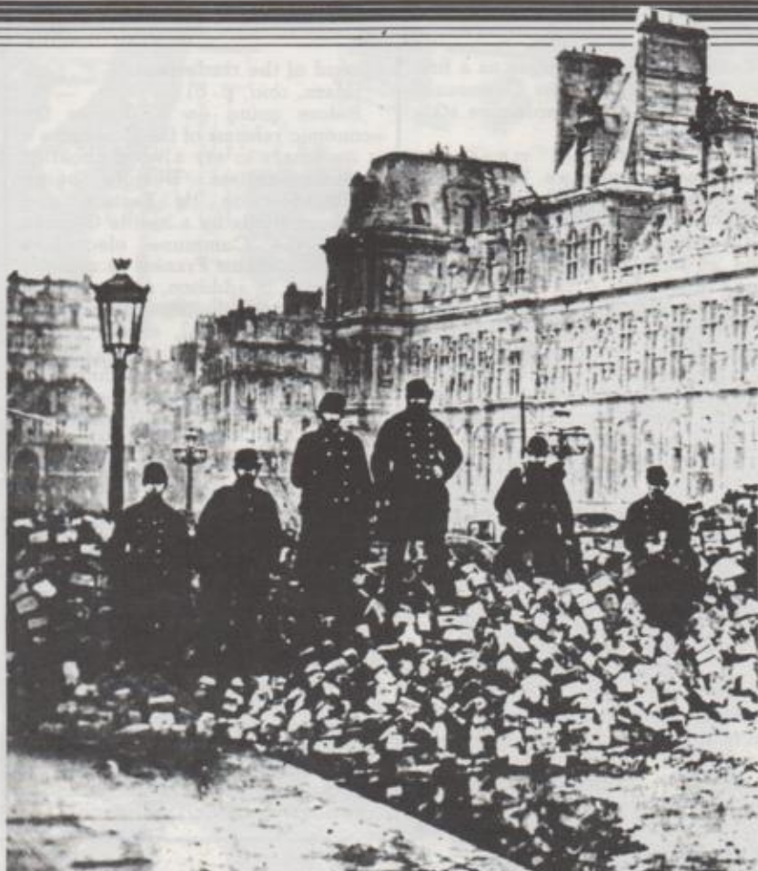
Street barricade defends the Commune.

In keeping with its role at the head of an entirely new form of state, the Commune was an entirely new type of body. All delegates were subject to recall by the constituents at any time. The Commune was no mere Parliamentary talking shop, it was also the executive body, its members had to carry out their own policies, breaking down an important barrier