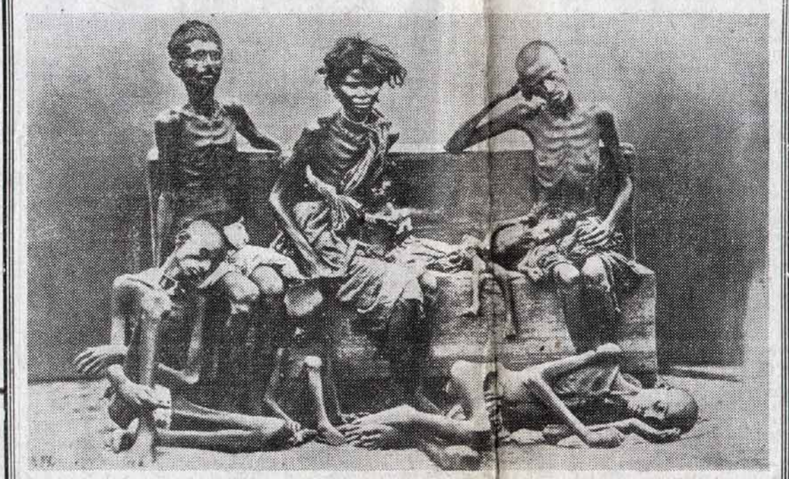
Indian Famine 1942.—This picture shows the condition to which millions of Indian workers and peasants were reduced in the last famine in which millions died of hunger. According to the "Daily Mail", 100,000,000, one quarter of the entire population of India are threatened with starvation. These are the benefits of British rule.

of food are kept from the starving by the financial, military, commercial and oppressive needs of the great powers.