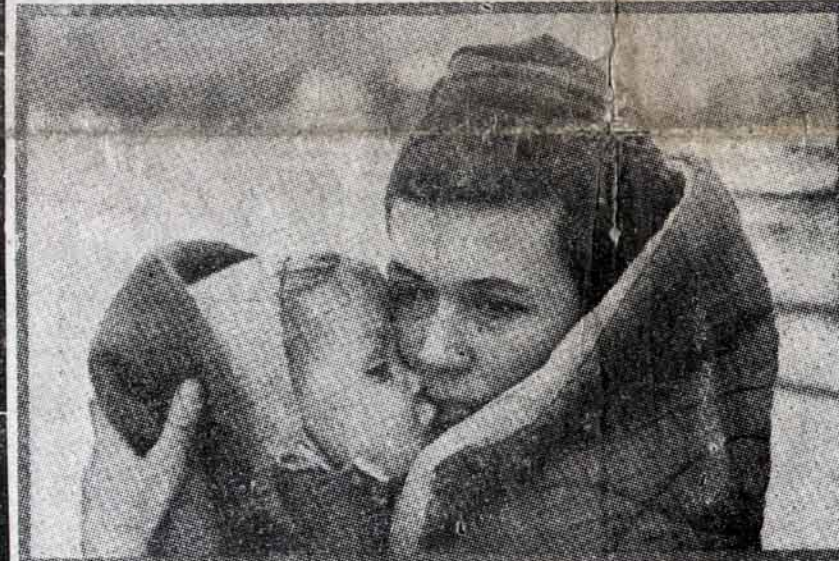
One 3-year-old boy survived the 270-mile journey, only to die in his mother's arms as she carried him down the railroad tracks into Berlin.