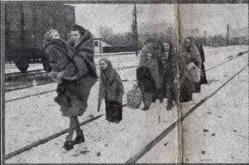
In October, 150 German women and children set out from Lodz, hoping to find refuge in the British zone of Berlin. They had no supplies of food except what they could beg from the hostile Poles and Russians along the route that they travelled. All died on the road except this small band.