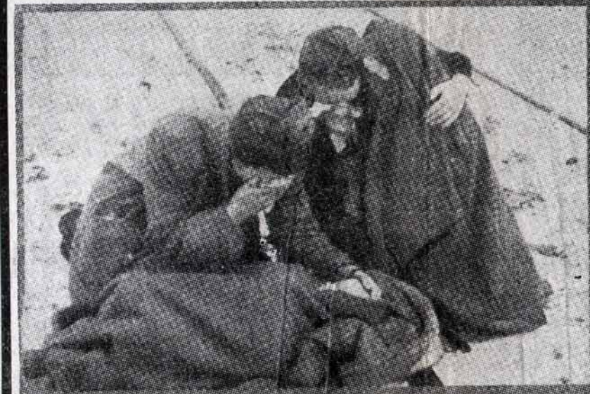
She lays his body on the tracks while another mother and child weep beside her. The survivors reached the British zone of Berlin but found it stripped almost bare of food by the horde of refugees which has poured in from the east.