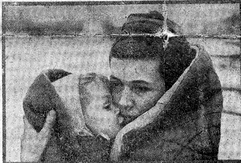
One 3-year-old boy survived the 270-mile journey, only to die in his mother's arms as she carried him down the railroad tracks into Berlin.