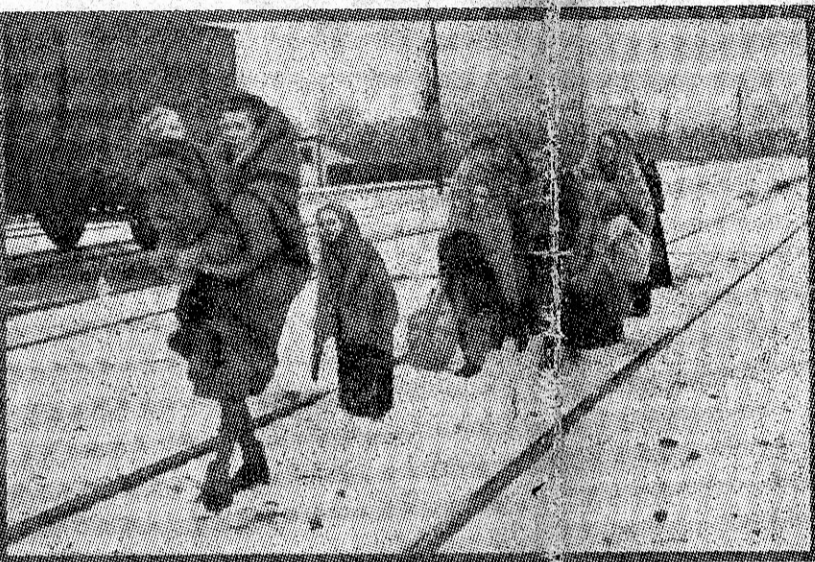
In October, 150 German women and children set out from Lodz, hoping to find refuge in the British zone or Berlin. They had no supplies of food except what they could beg from the hostile Poles and Russians along the route that they traveled. All died on the road except this small band.