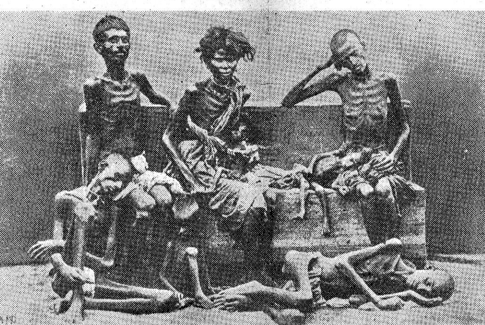
Indian Famine 1942.—This picture shows the condition to which millions of Indian workers and peasants were reduced in the last famine in which millions died of hunger. According to the "Daily Mail", 100,000,000, one quarter of the entire population of India are threatened with starvation. These are the profits of British rule.

of food are kept from the starving by the financial, military, commercial and oppressive needs of the great powers.