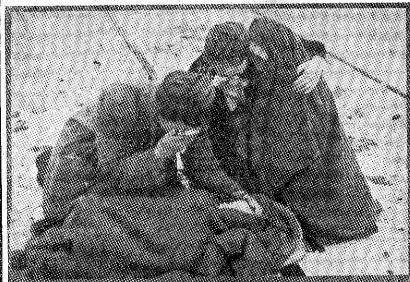
She lays his body on the tracks while another mother and child weep beside her. The survivors reached the British zone of Berlin but found it stripped almost bare of food by the horde of refugees which has poured in from the east.