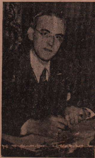
CRIPPS— Popular with the Tories

The basic fallacy here lies in the fact that it is precisely the nationalised heavy industries which will be harder hit by a slump than any other. It is steel, coal, railways, electricity, the bulk of whose product and services go to supply other industries, which must be affected