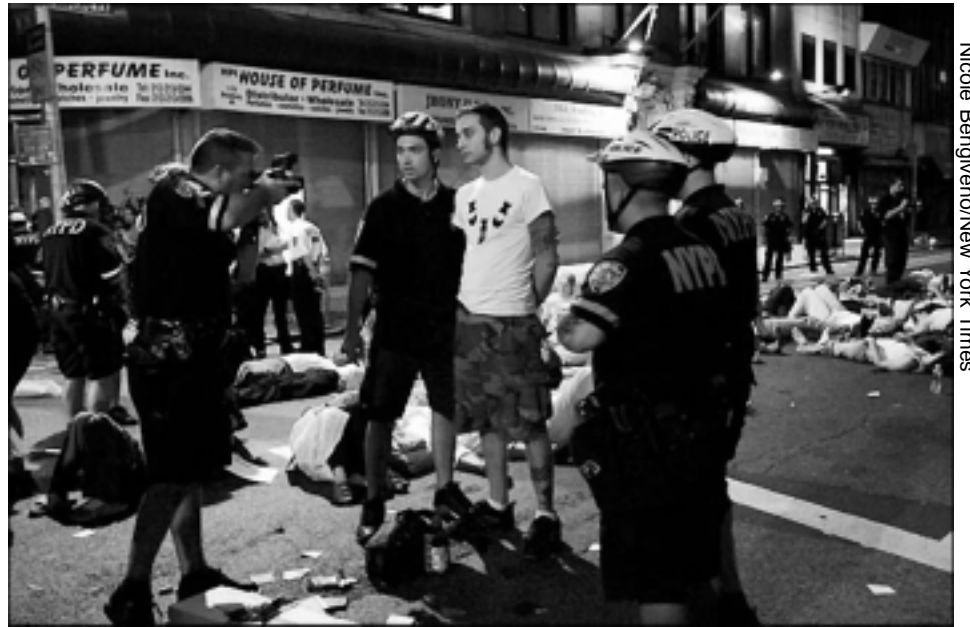
Dress rehearsal for internal war: NYC rulers screamed about “anarchist threat” as they prepared to carry out mass arrests of more than 1,800 protesters on the flimsiest of trumped-up charges. Drop all charges against RNC protesters!