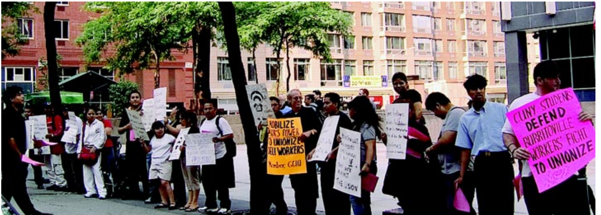
Trabajadores de los restaurantes Burritoville frente al Edificio Federal en Nueva York, el 30 de junio. “Departamento Laboral, ¡instrumento patronal!” gritaron.