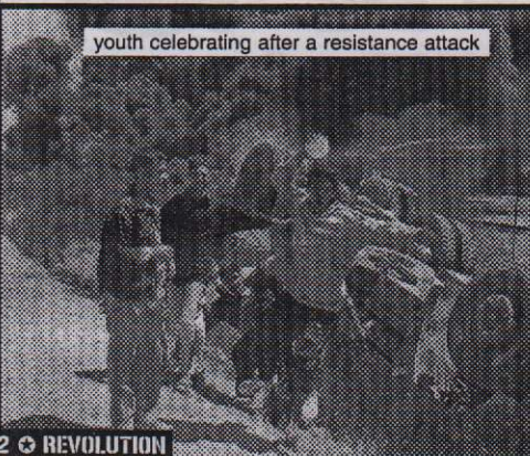
youth celebrating after a resistance attack

The Shia Cleric Al Sadr is a leader of one of the uprisings. The Americans have captured one of his aides and shut down his newspaper in an attempt to silence him. This has only served to spark mass protests, which quickly spread like wildfire across the country. Shia and Sunni population centres in the north and south have exploded with rage – uniting in their hatred of the American occupation. Districts of Baghdad have also answered the call to arms and started shooting coalition soldiers in the streets.