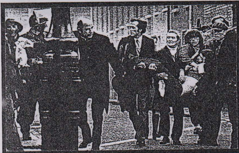
BLOODY SUNDAY DERRY 1972 •

REALITY OF BRITISH RULE • BRITISH TROOPS SHOT 13 CIVILIANS DEAD