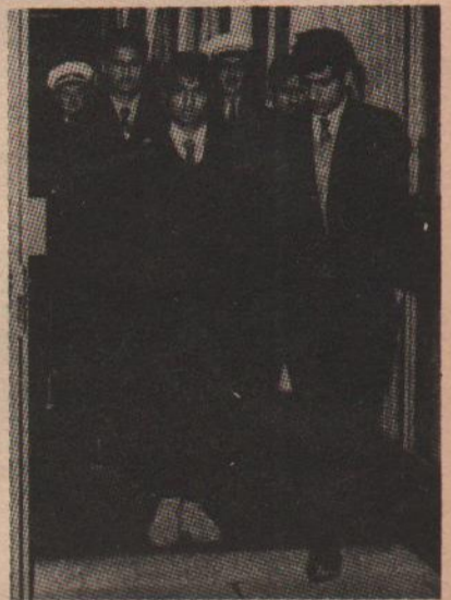
Four 'illegal' immigrants in the custody of immigration officials

Nor is it just a question of cooperation: during one recent raid a policeman jokingly referred to himself as a member of the 'Immigration and Repatriation Squad'. The influence of Powellism seems to extend inside the police force as well.