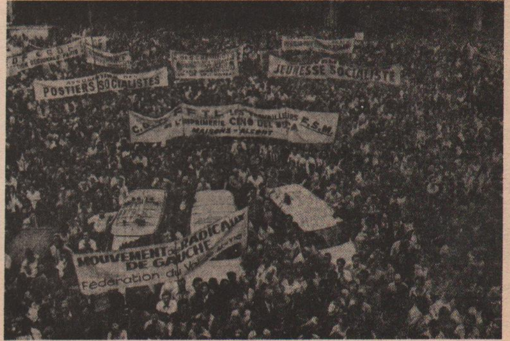
Part of mass rally held in Paris last week in solidarity with the Lip workers

There have also been a number of actions by journalists after police in Besancon seized three