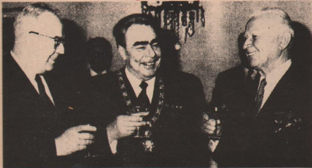
Soviet Communist Party secretary, Mr Brezhnev (centre) together with Czechoslovak party leader, Gustav Husak (left) and President Svoboda (right) in Prague earlier this year