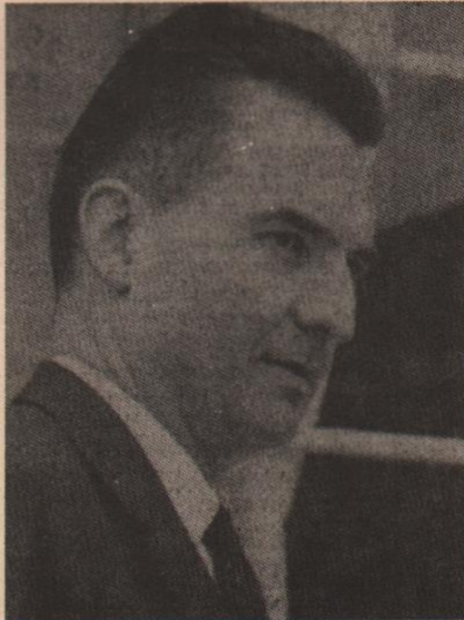
M. Charbonnel, Minister for Industrial Development

If it is clear that victory at Lip depends on an extension of the struggle to other sections of the working class, it is equally clear that the potential for this exists. The determination shown by the Lip workers as the struggle developed, the imaginative methods of struggle which they employed, the way in which all major decisions were democratically referred to mass meetings of all the workers — these found a ready response in the working class as a whole.