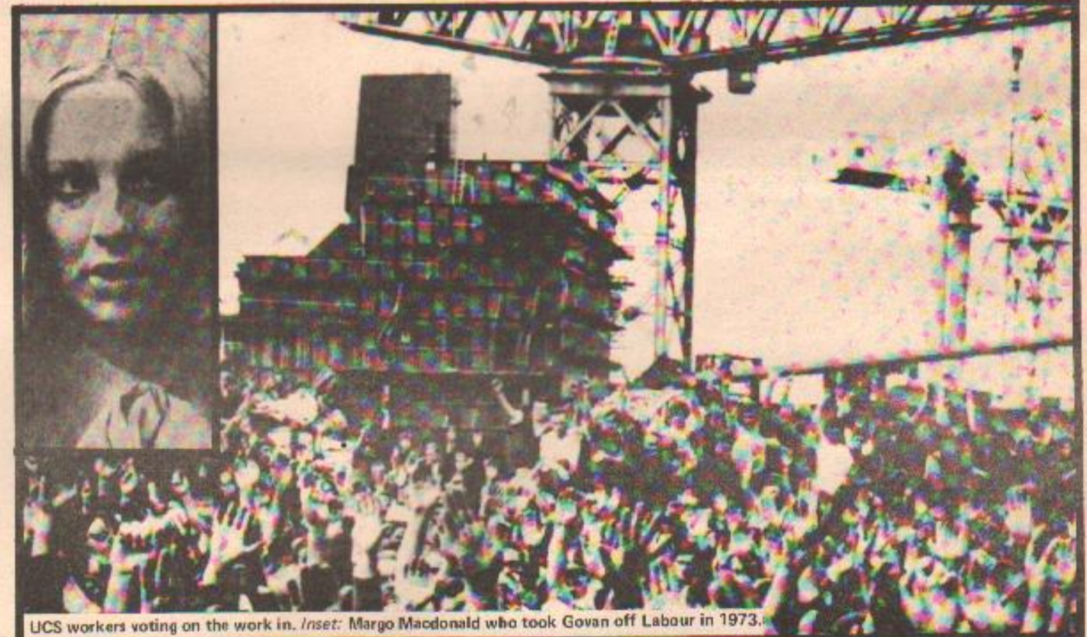
UCS workers voting on the work in. Inset: Margo Macdonald who took Govan Labour in 1973.

This is at its clearest in any comparison with the Basque country. In mid-September 17 mayors from that region presented a petition to the Spanish Interior Minister. It demanded local control of the police to prevent the now common shooting of nationalist demonstrators, permission to fly the then-banned