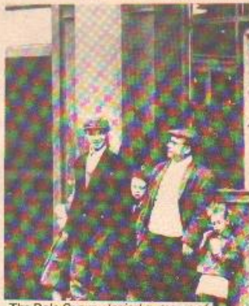
The Dole Queue - logical outcome of regional policies

The industries which built the expansion of the nineteenth century find themselves ground down under foreign competition. In ship-building the Clyde is now building less than half the tonnage of the early years of this century. This involved a post-war loss of 30,000 in its labour force. In steel production, Scotland's share of the British total has slumped from half its total in the same period, with a similar loss of labour to that in shipbuilding. Mining completes the pattern with two-thirds of its jobs lost since the late 1950s. The end result has been a net fall in the male