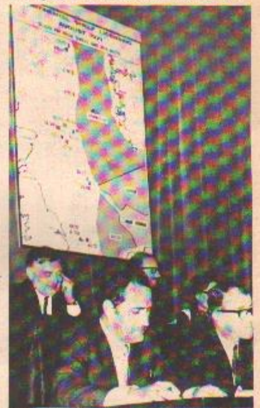
GOING FOR A SONG - Auctioning blocks of the North Sea to the Oil Companies.

Development Agency or any future Scottish banking system, both of which they are vehemently against. For the same reason, proportional representation is now enthusiastically embraced by many British and Scottish industrialists, in the hope of blocking any 'extremist' government, be it nationalist